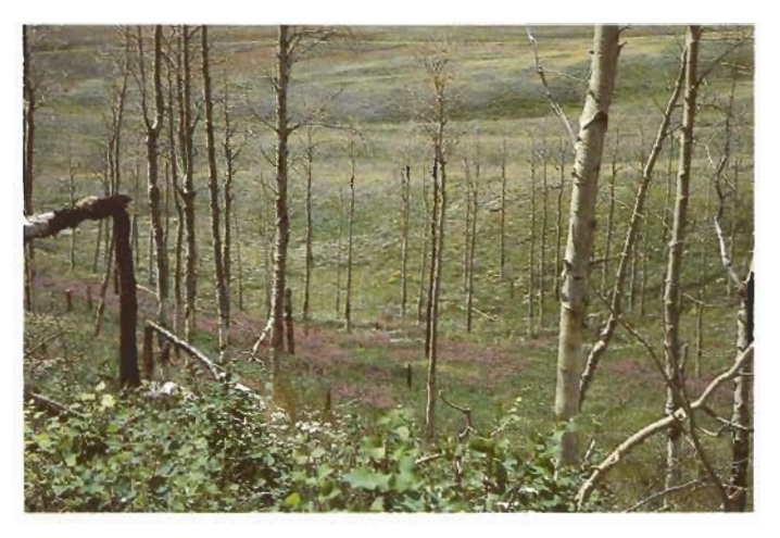
Figure 9.—Fire on this relatively dry site in western Wyoming rejuvenated this derelict stand of aspen. There were about 12,000 suckers per acre and about 3,200 pounds per acre of understory production in this second postburn year.

If fire occurs at infrequent intervals (e.g., 50 years) (Baker 1925) and is moderately intense enough to kill most or all of the aspen and competing conifers, most aspen sites in the West will retain viable stands of aspen. More frequent fires may adversely affect site