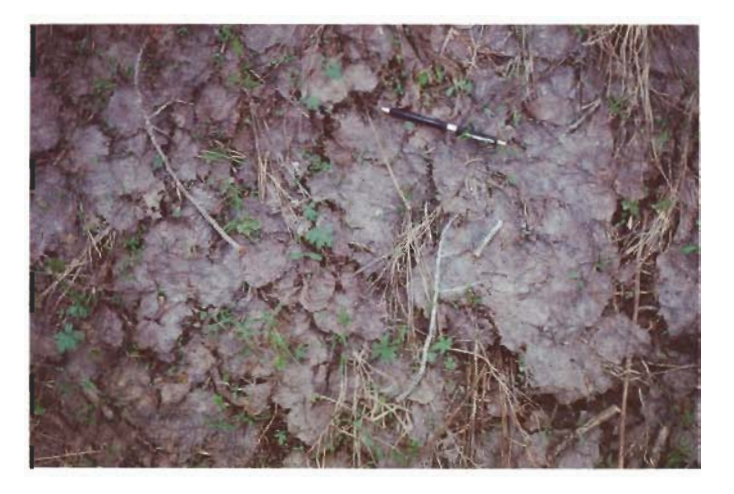
Figure 6.—As illustrated in this vertical view, the matted forest floor in a typical aspen stand just after snowmelt in spring does not carry fire, especially after rapid greenup begins.