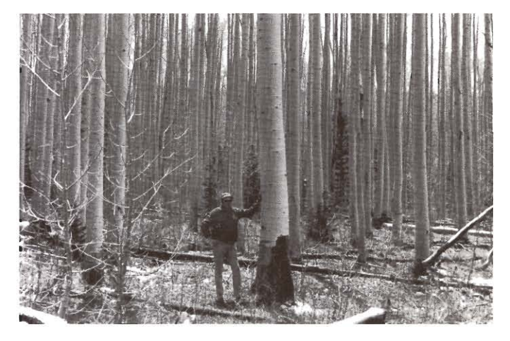
Figure 1.—Pure even-aged aspen that probably originated from fire about 90 years ago. This excellent quality commercial aspen is on a good site in southwestern Colorado.

It is clear that many aspen stands, in the absence of fire, are replaced by grass, forbs, shrubs, or conifers (Beetle 1974, DeByle 1976, Krebill 1972, Schier 1975a).