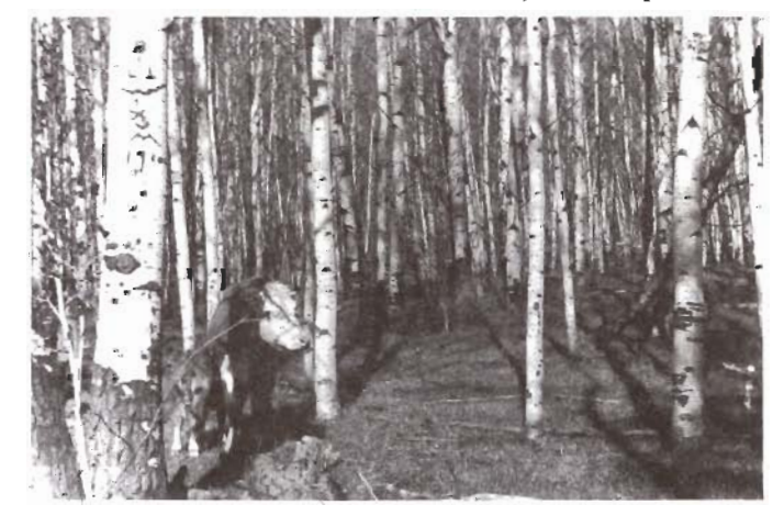
Figure 5.—Grazing by cattle or sheep reduces fine fuels in the aspen understory, which, in turn, reduces the flammability of the aspen forest.

A severe fire removes the insulating duff, blackens the soil surface, and permits more solar radiation to effectively warm the mineral soil. A very severe fire also may kill roots in the surface 0.75-1 inch (2-3 cm) of soil (Horton and Hopkins 1965). Either or both of these effects may have contributed to the findings of Schier and Campbell (1978a), who reported an average suckering depth of 4 inches (10 cm) under a severe burn (more than 90% of the litter and duff consumed) as compared to