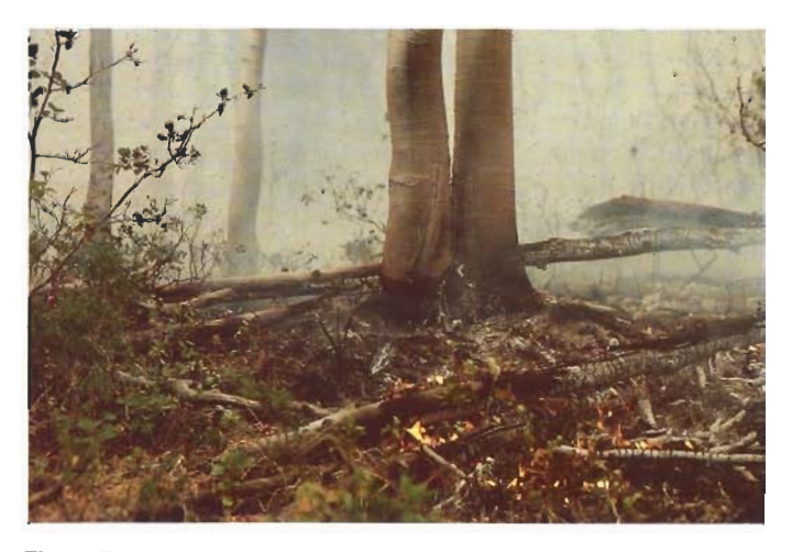
Figure 7.—A surface fire that burns around the base of aspen trees girdles and kills this thin-barked species.

2.5-3 inches (6-7 cm) under a moderate burn in Wyoming. Removal of all organic debris and exposure of bare mineral soil by fire also provides an ideal seedbed for the possibility of aspen seedling establishment.