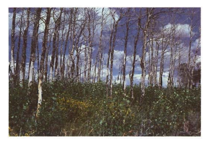
Figure 8.—A dense sucker stand 3 years after fire killed the pure aspen overstory.

several sites in western Wyoming (Bartos 1979), certainly enough to adequately regenerate aspen on those sites (fig. 9).Also, after an initial decline during the first postburn year, Bartos (1979) and Bartos and Mueggler (1979) measured an increase in herbage production for several years on these burned sites.