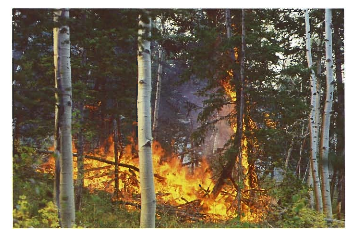
Figure 2.—Fire that kills the overstory in mixed aspen-conifer stands results in prolific aspen root suckering. Aspen often dominates sites such as this for perhaps a century after burning.

Fechner and Barrows (1976) proposed that existing aspen stands might be maintained and new stands