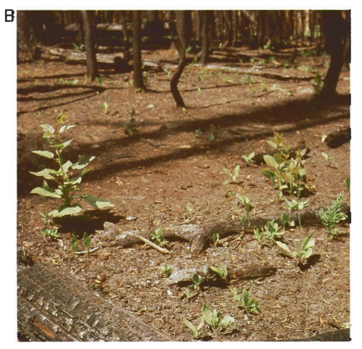
Figure 3.—(A) A wildfire in June killed this mixed forest of aspen, lodgepole pine, and other conifers. (B) The scattered aspen trees in this forest produced enough aspen suckers by the end of that growing season to largely restock the site.