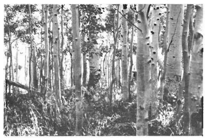
Figure 2.—A stable, uneven-aged aspen community in northern Utah.