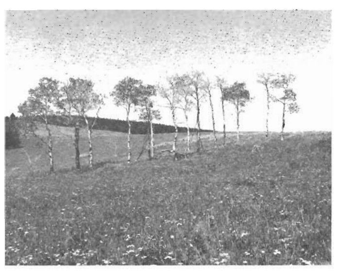
Figure 3.—A degenerating aspen community in southern Montana being replaced by mountain grassland vegetation.

during gradual deterioration of the clones (Schier 1975a) (see the VEGETATIVE REGENERATION chapter). Regeneration also can fail because of animal use. Where suckering does occur in a decadent clone, continued heavy browsing by wildlife or livestock can prevent suckers from developing into trees and cause a gradual conversion to grasslands or shrublands. (See the ANIMAL IMPACTS chapter.)