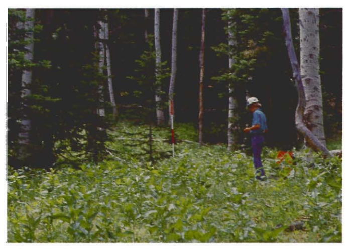
Figure 1.—A seral aspen community in northern Utah rapidly being replaced by Engelmann spruce and subalpine fir climax forest.

There have been only a few, geographically narrow attempts to classify aspen communities into recognizable associations based upon floristics and/or environment. Although interest in classifying aspen communities is increasing (Hoffman and Alexander 1980,