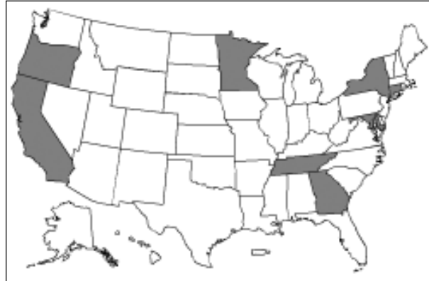
Figure 1. States included in Active Bacterial Core surveillance in 1999. Surveillance for all pathogens was conducted statewide in Connecticut but in selected counties only for some or all pathogens in the other states.

California, Georgia, Maryland, Minnesota, New York, Oregon, and Tennessee (Figure 1). (For certain pathogens, surveillance is conducted statewide in Georgia, Maryland, Minnesota, and Oregon). The total population under surveillance in 1998 ranged from approximately 17.4 million for S. pneumoniae to 30.4 million for N. meningitidis .