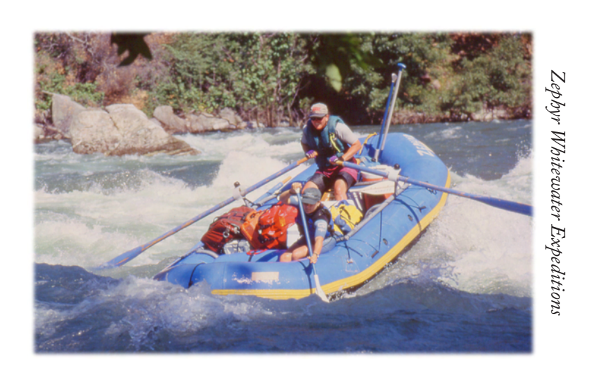
Get wild! Find out more about rafting the Wild and Scenic Tuolumne River and other recreational opportunities. Visit our website @ www.fs.fed.us/r5/stanislaus.