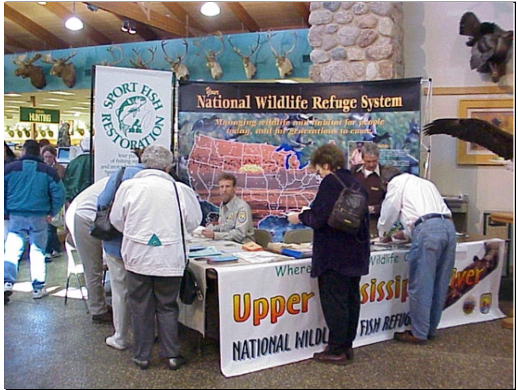
Service on Display. More than 6,000 visitors learned about the National Wildlife Refuge System and other Service programs during the spring Expo at Cabela's.

In a written statement to Service special agents, the farmer admitted to mixing Warbex with oats then spreading it around a feed lot to kill nuisance black birds. Service special agents accompanied by Missouri