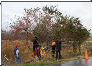
Missouri Valley, Iowa, Boy Scouts help remove invasive honeysuckle vines from DeSoto NWR as part of earning their conservation badge.