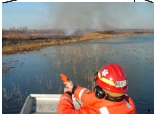
Sherburne NWR Fire Technician Chris Mursu fires a flare from the deck of an airboat during a late fall prescribed fire at Rice Lake NWR.