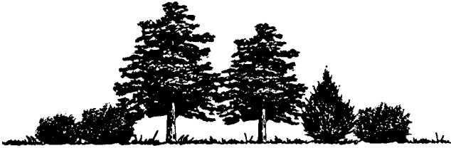
Figure 2. Ladder fuels enable a fire to travel from the ground surface, into shrubs and then into the tree canopy.

But the primary concern with shrubs is that they are a "ladder fuel"--they can carry a relatively easy-to-control surface fire into tree crowns. Crown fires are very difficult, indeed, sometimes impossible, to control (see Figure 2). To reduce the fire spreading potential of shrubs, plant low-growing, non-resinous varieties close to structures. (Recommended plants are listed in Service in Action 7.201, 7.406, 7.407, 7.408, 7.413.) Do not plant directly beneath windows or vents, or where they might spread under wooden decks. Do not plant shrubs under tree crowns, or use them to screen propane tanks, firewood piles, or other flammable materials. Plant shrubs individually, as specimens, or in small clumps apart from each other, and away from any trees within the defensible space.