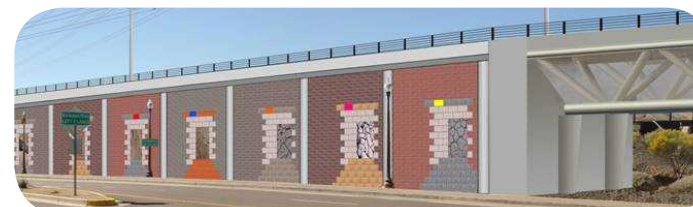
Artwork will adorn the walls of the Town Lake light rail bridge.

This design includes silk-screened digital photos on canopies that create "ghost shadows." An etched glass sculpture in the center represents a digitized mesquite tree.