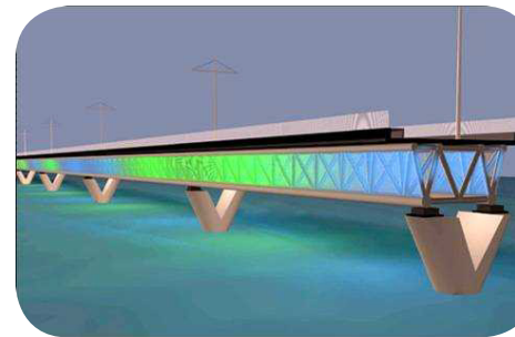
Artist Buster Simpson's rendering of the Tempe Town Lake light rail bridge.