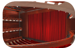
Main Theater balcony

In coming issues, Art Talk will explore some of the unique features currently being constructed from designs by this talented team of professionals.