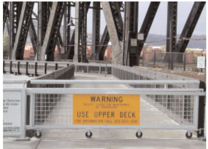
Steel Bridge Riverwalk warning sign. Portland, OR

Another important issue is responsibility for retaining walls, cut-and-fill areas, drainage culverts, barriers and signs, and bridges and trestles. For example, a new RWT may require extension of an existing cut area or construction of a retaining wall. This area may already have erosion or landslide problems that are handled by the railroad. RWT managers may need to assume full responsibility for any structure, culvert, or natural condition within its easement, regardless of whether it is a pre-existing condition or not. The feasibility study team must understand the existing geological, hydrological, structural, and other conditions, and estimate the capital and maintenance costs.