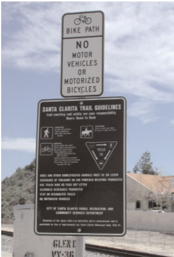
Trail regulations sign. Santa Clarita, CA