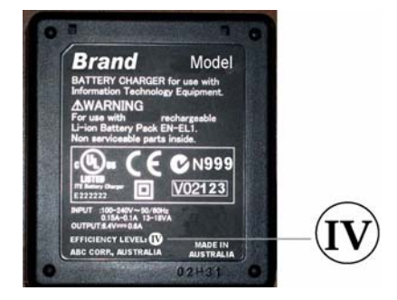
Figure 1: Illustration of International Efficiency Mark

• The international efficiency marking protocol is a system to determine the minimum efficiency performance of an EPS, regardless of where it is manufactured and sold. The implementing agencies as of March 2005 are the AGO, California Energy Commission, CECP, and ENERGY STAR.