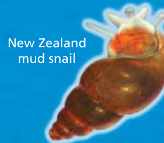
New Zealand mud snail