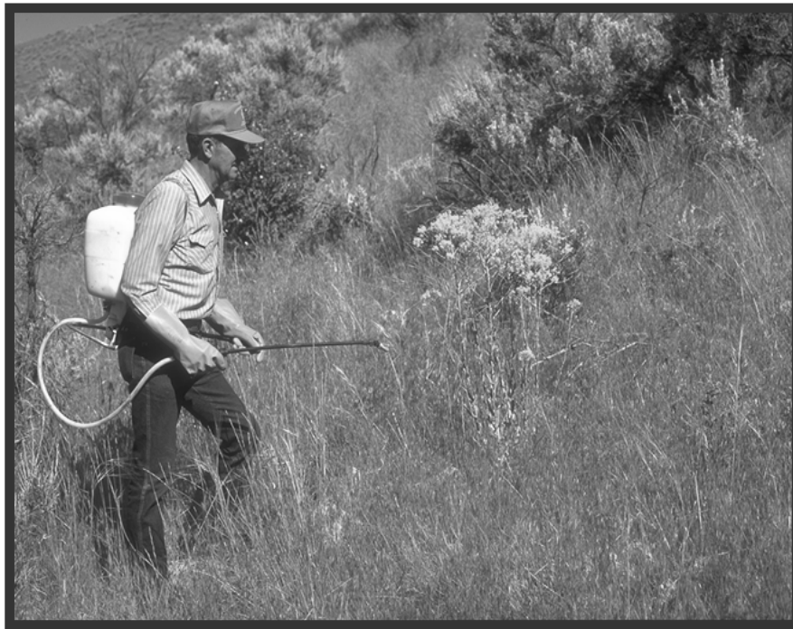
Typical Backpack Spray Operation