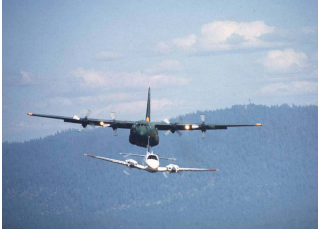
One of the FS' Beechcraft Baron Lead Planes Leading An Air Tanker

The Forest Service (FS) owns a fleet of 19 Beechcraft Baron planes. These are used primarily as “lead planes” to direct other planes carrying flame retardant during firefighting operations. The lead planes are also used in aerial supervision to provide logistical and tactical support for firefighters on the ground, and to manage air traffic.