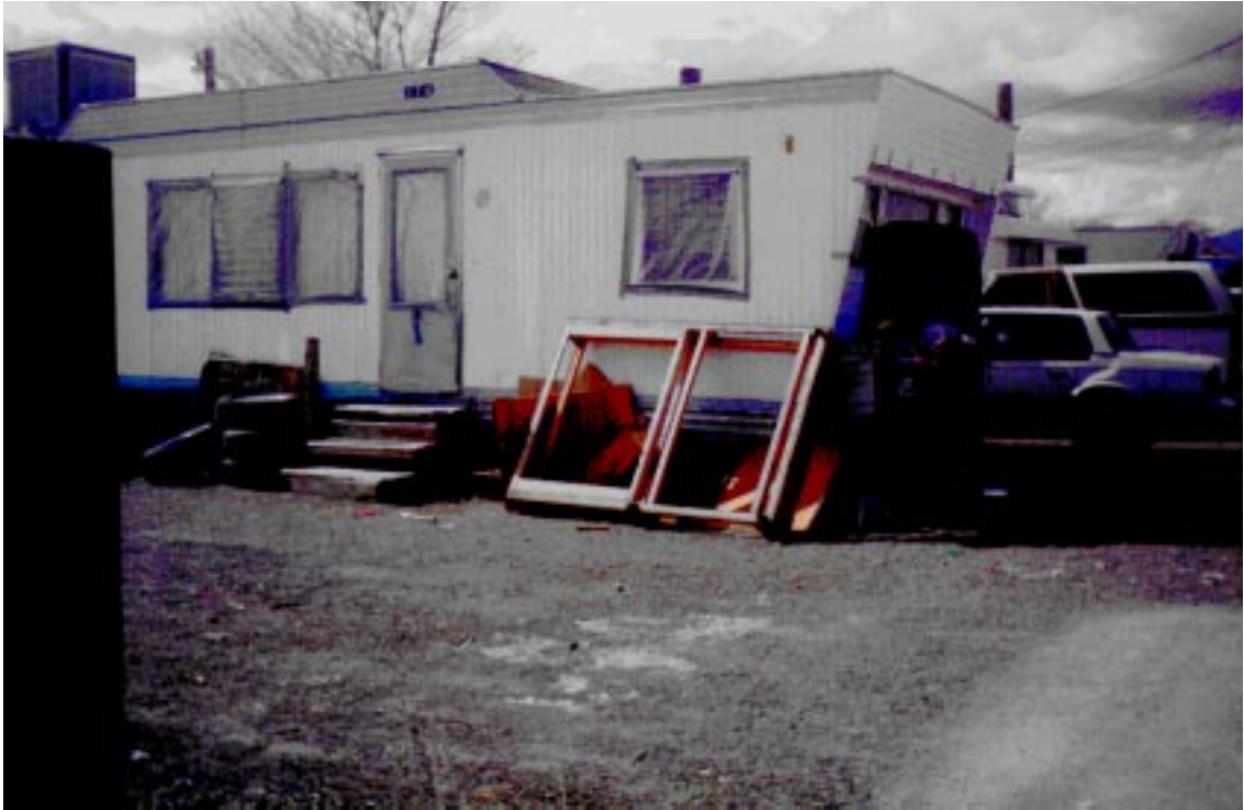
Trailer used to provide day care in Utah.

director of the sponsoring agency, who may have conspired to set up at least 40 false providers. The claims submitted for these false providers resulted in improper reimbursements totaling more than $700,000 over the last 3½ years. The investigation is ongoing and involves money laundering through bank accounts set up in fictitious names, submission of false claims, submission of false statements and mail fraud.