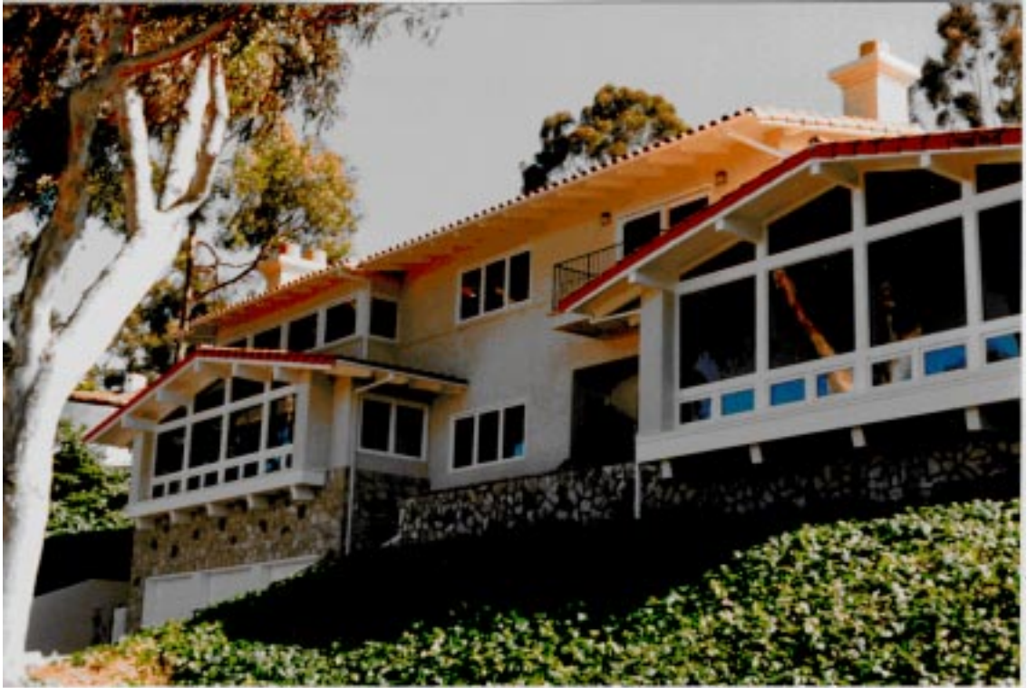
5,000 square-foot home forfeited by sponsor.

The husband was sentenced to 2 years in Federal prison and the wife to 3 years. They were ordered to pay the Government $2.2 million in restitution and had already forfeited four residential properties they owned, including their 5,000 square-foot home in an exclusive neighborhood in Southern California.