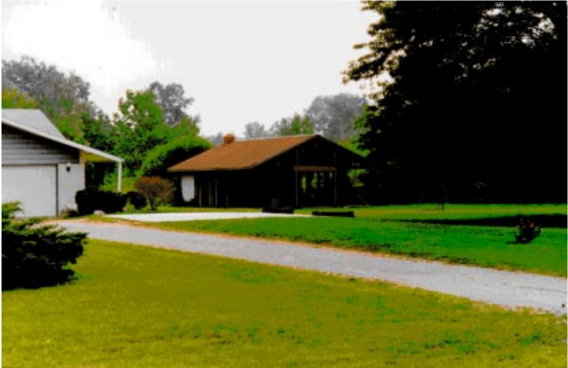
Vacant lot in Ohio used as an address of a day care provider to obtain payments.

Stealing program funds is a monetary loss to USDA, but even more significant is the suffering that children endure because of these disreputable sponsors. For many sponsors, we found little or no help being given to providers in terms of nutritional awareness. In many cases, the stolen program funds directly reduced the money available to purchase food for needy children. We also identified health and safety problems at numerous locations, including unsanitary feeding sites, dangerous "pets" present, and inadequate supervision of children in day care.