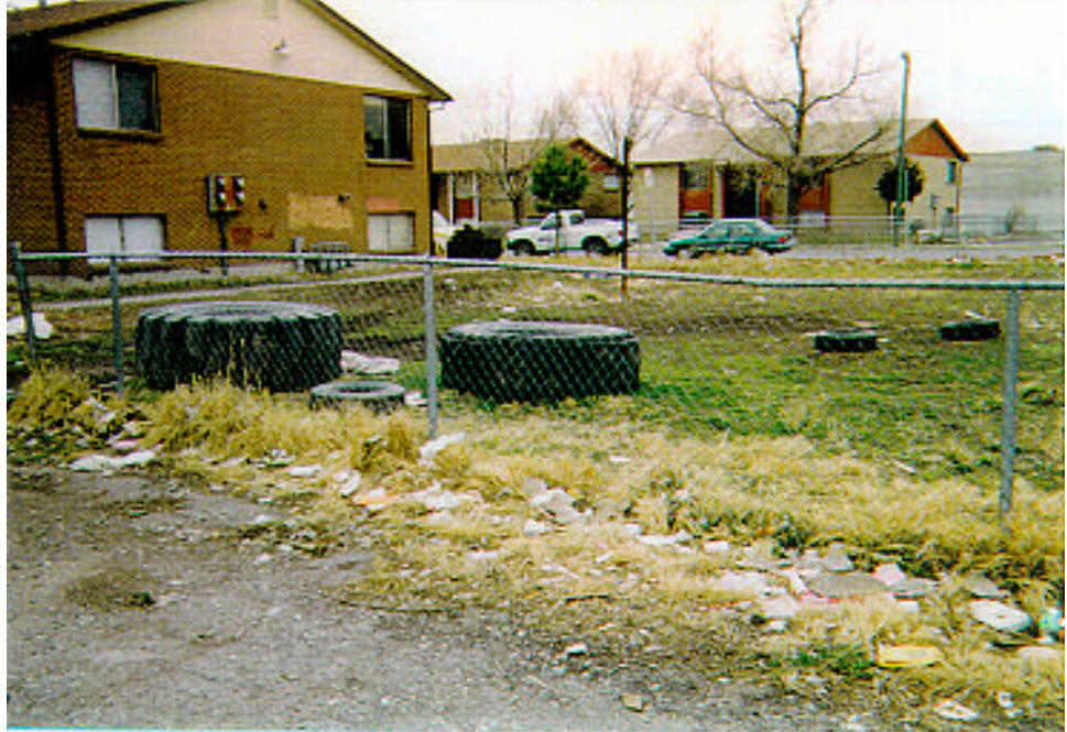
PHOTO NO. 7 - UNSAFE CONDITIONS AT A UTAH APARTMENT COMPLEX WHERE SEVERAL DAY CARE PROVIDERS OPERATED.