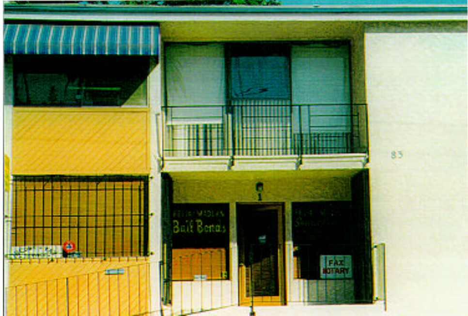
PHOTO NO. 4 - BUILDING OWNED BY CBIA'S EXECUTIVE DIRECTOR AND HER HUSBAND SHOWING BAIL BOND AND OTHER SERVICES AVAILABLE ON FIRST FLOOR. CACFP OFFICES WERE LOCATED ON THE SECOND FLOOR.

The sponsor also failed to pay all its providers and centers within the time period allowed.