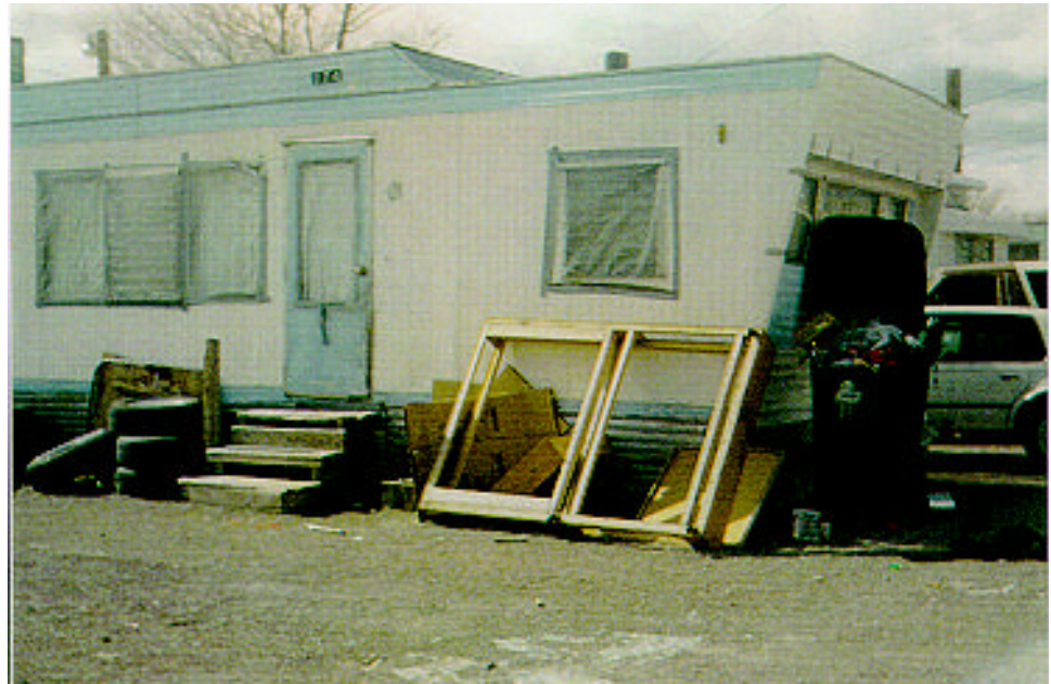
PHOTO NO. 8 - UNSAFE CONDITIONS OBSERVED AT SMALL TRAILER USED FOR DAY CARE IN UTAH.