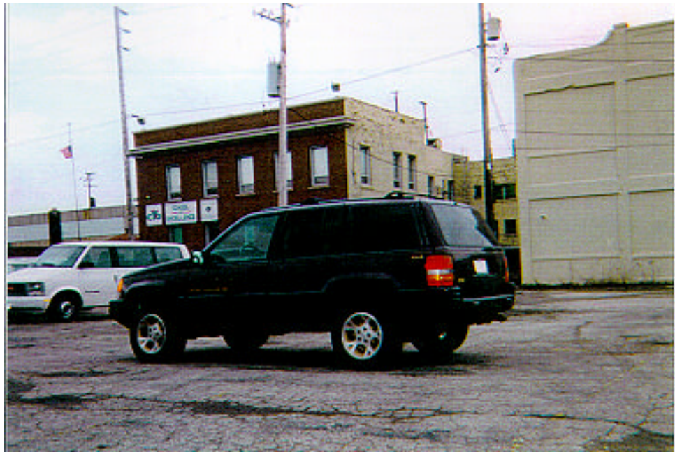
PHOTO NO. 5 - VEHICLE LEASED BY CHILDREN'S SPECTRUM WITH CACFP FUNDS. PARKED AT WISCONSIN LOCATION WHERE CHILDREN'S SPECTRUM'S EXECUTIVE DIRECTOR HAD ANOTHER FULL-TIME JOB.

While residing and working in Wisconsin, the executive director claimed a salary from the California sponsorship and had the exclusive use of a leased vehicle that was charged to the program (see photo no. 5). We also determined that for a 6-month period, the executive director received Unemployment Compensation Benefits from Wisconsin despite receiving his salary from the sponsorship in California.