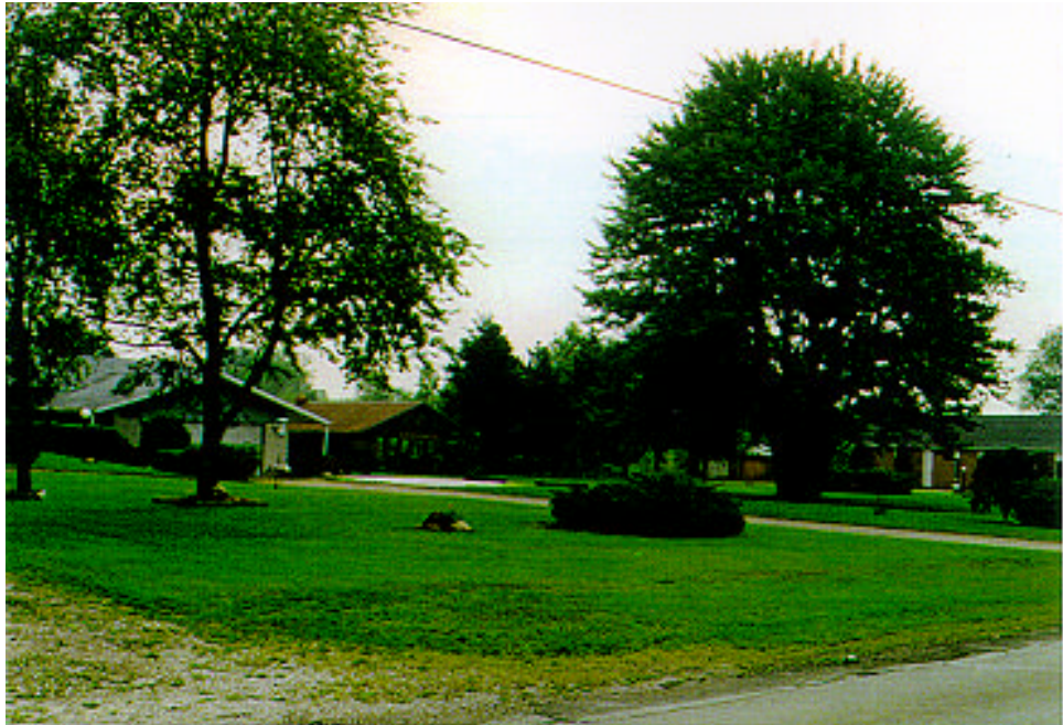
PHOTO NO. 6 - VACANT LOT LISTED AS ADDRESS FOR ACTIVE DAY CARE PROVIDER SPONSORED BY NEW JERUSALEM CHURCH OF GOD IN CHRIST IN OHIO.

Our visits to the sponsor's provider homes showed that 5 provider addresses did not appear to exist. In some cases, provider addresses were for abandoned houses or vacant lots (see photo no. 6), and in other cases, residents at the addresses denied any association with the CACFP or the sponsor. At 21 homes, we found no one home during established serving hours despite repeated visits and telephone calls. Furthermore, we found 22 instances where the name of the provider, as documented in the sponsor's records, was not the same as the name of the resident. One month after our home visits, 80-percent of the providers that did not appear to exist submitted claims for meal reimbursements of about $23,300, and the sponsor claimed $1,848 in administrative costs associated with those providers.