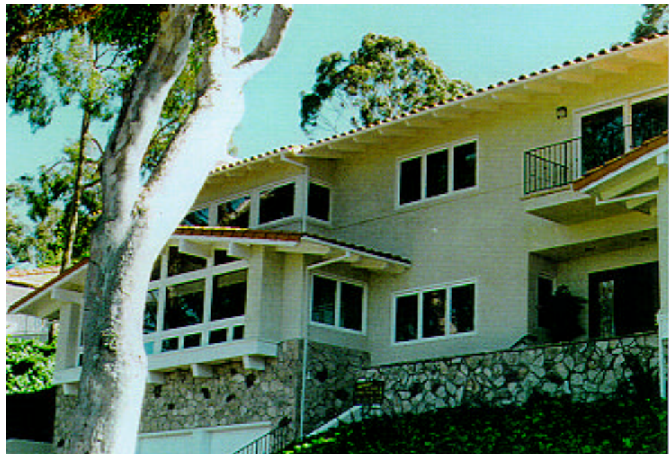
PHOTO NO. 2 - 5,000 SQUARE-FOOT HOME FORFEITED BY PAAM, A CALIFORNIA CACFP SPONSOR.

Following their guilty pleas, the husband was sentenced to 2 years in Federal prison and the wife to 3 years. They were ordered to pay the Government $2.2 million in restitution and forfeited four properties they owned, including their 5,000 square-foot home in an exclusive neighborhood in Southern California (see photo no. 2).