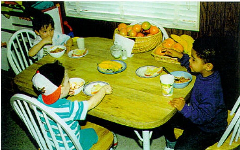
PHOTO NO. 1 - CHILDREN IN DAY CARE ENJOYING A MEAL.

The program is administered at the Federal level by the Food and Nutrition Service (FNS) and at the State level by a State agency. State agencies administer their programs through public or nonprofit sponsoring organizations which act as a liaison between the State agency and participating day care facilities. Sponsors are ultimately responsible for program operations in those facilities.