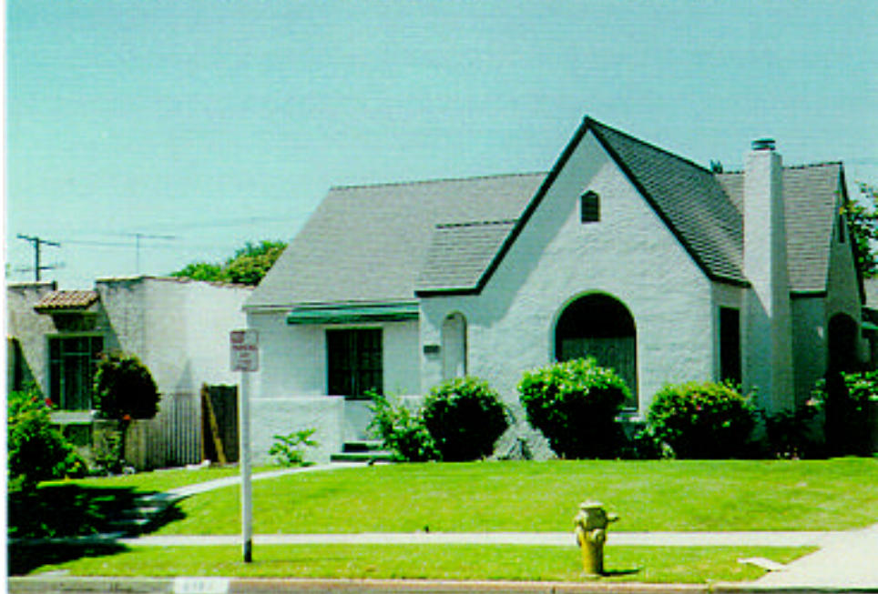
PHOTO NO. 3 - ANOTHER HOME (SOLD FOR $415,000) FORFEITED BY PAAM, A CALIFORNIA CACFP SPONSOR.

The sponsor's former executive director and program director engaged in a separate fraud scheme. They submitted false claims for nonparticipating providers, and, as a result, the sponsor was reimbursed in excess of $60,000 for these claims. The executive director and program director used these funds for their own personal use. Following their guilty pleas, they were each sentenced to 7 months in prison, 3 years' probation, and ordered to pay a total of $60,000 in restitution.