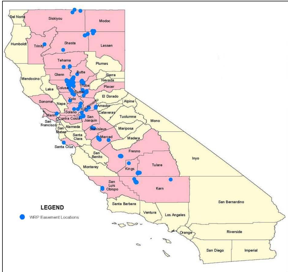
Figure 1: Locations of WRP Easements in California