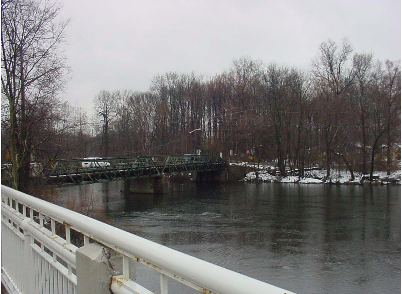
01382000 Passaic River at Two Bridges Watershed Integrator Station Ambient Stream Monitoring Network