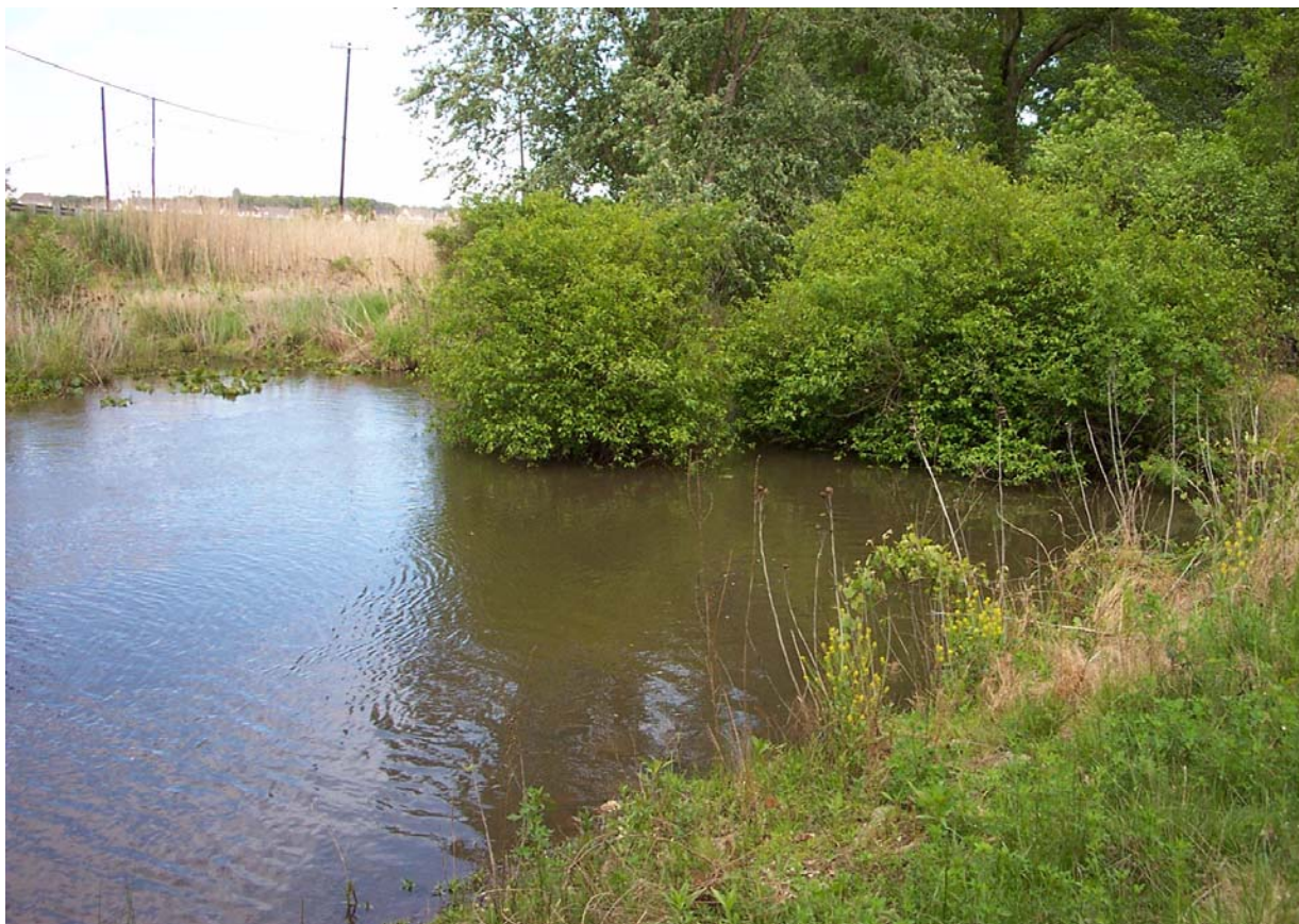
01400640 Millstone River near Grovers Mill Agricultural Land Use Indicator Station Ambient Stream Monitoring Network