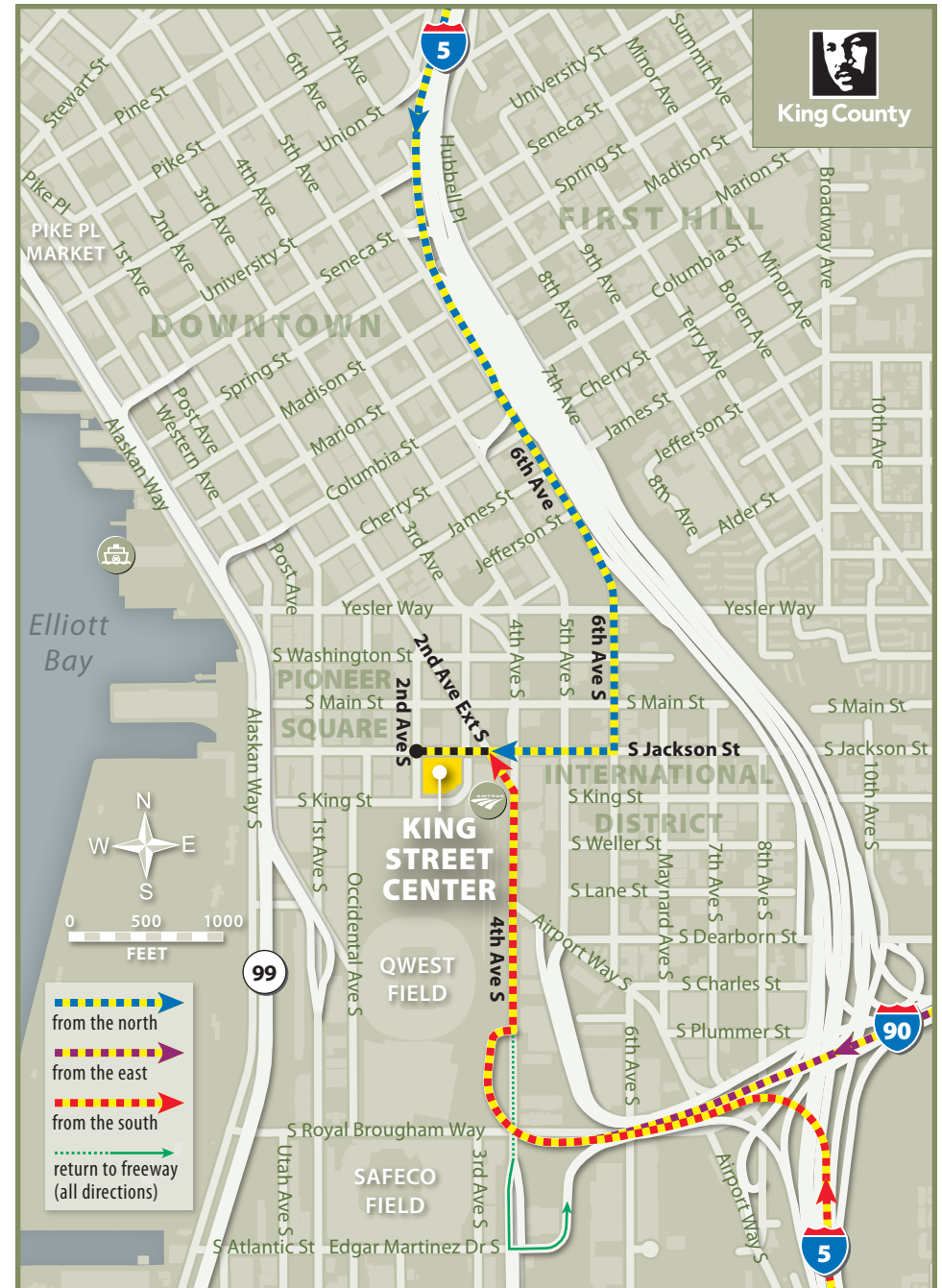
Downtown Seattle, Pioneer Square Vicinity