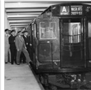
Longest, Coolest Train Still a-Thrumming at 75