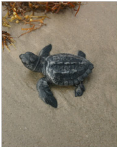
National Park Service