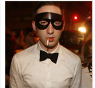
Last Night of Misshapes: Hip and Through