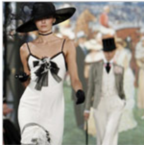
Ralph Lauren, Fabulous City Slicker