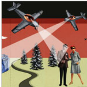
Germany on Tiptoe Over Terror