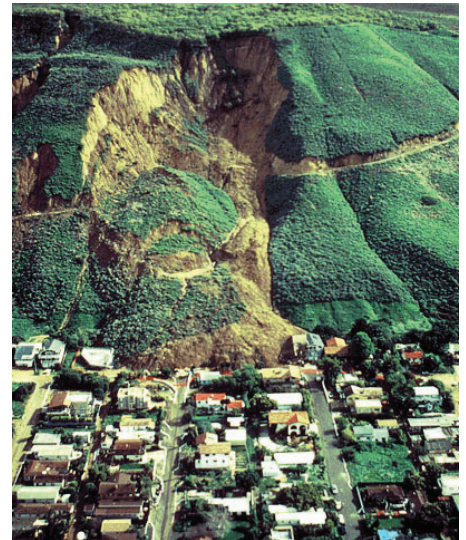
Homes lie damaged under this large earth flow in LaConchita, Calif., Saturday, March 4, 1995. On January 10, 2005, a portion of this area became a debris flow during heavy rain, destroying several homes and killing 10 people.