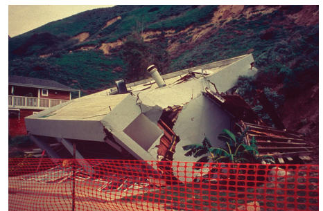
This house was crushed by the LaConchita, Calif., earth flow, Saturday, March 4, 1995.