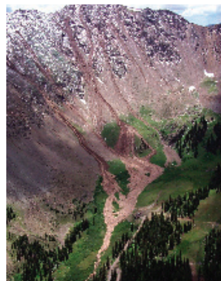
Debris flows, triggered by a rainstorm, move into and above the Arapahoe Basin ski area in central Colorado in 1999. The rain led to debris flows along the Interstate 70 corridor in Colorado, from Georgetown to the Eisenhower Tunnel.

The U.S. Geological Survey (USGS) develops methods to answer these questions to help protect U.S. communities from the dangers of landslides.