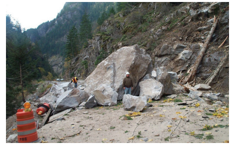
A rockslide on Highway 20 in Washington State cuts off access to Diablo, Wash., Sunday, November 9, 2003. The rockslide destroyed parts of the roadway and guardrail, and boulders and debris in excess of 100 tons, including a 50-ton boulder, blocked both highway lanes.

The USGS helps the public, policy-makers, and the emergency management community make informed decisions on how to prepare for and react to landslide hazards and reduce losses from future landslides.