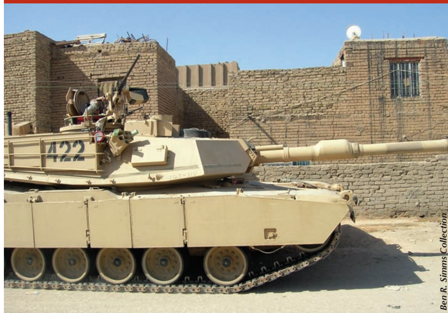
An M1A2 SEP tank operated by Company D, 2d Battalion, 8th Infantry Regiment, on a mission in Diwaniyah, August 2006

Throughout the day large crowds gathered on all sides of the perimeter we established around the recovery operation. The crowds would get as close as we would let them. Children would run to within fifty meters of the tank and throw rocks at the men and equipment involved in the recovery mission. The rocks were no more than a nuisance, but on two separate occasions grenades emerged from behind the crowd of children and