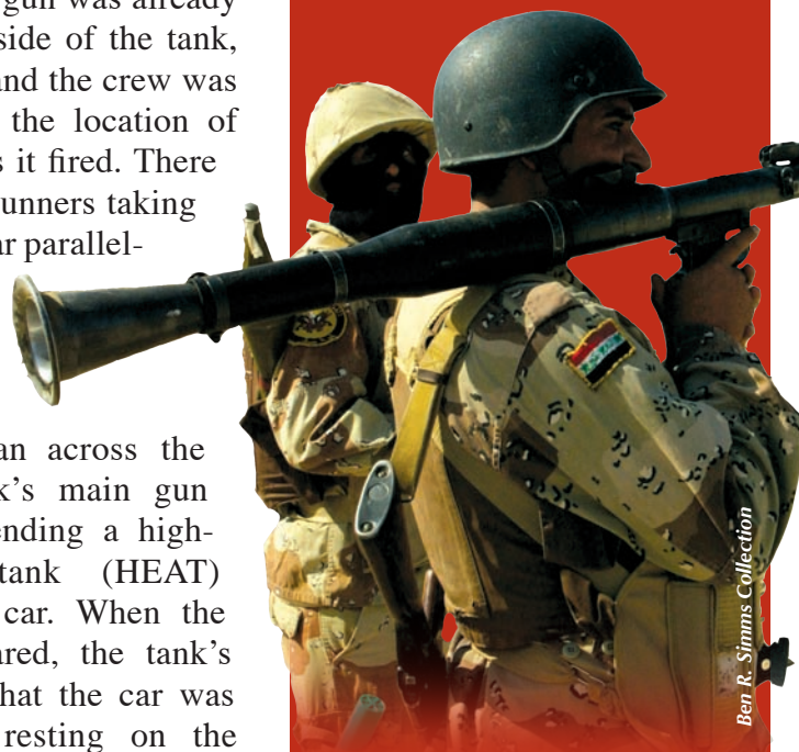
Above: Iraqi Army soldiers on a foot patrol in Divaniyah, with the soldier in foreground carrying a rocket-propelled grenade