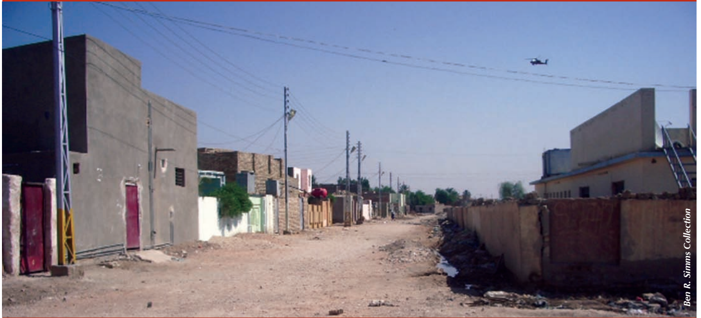
Ben R. Simms Collection