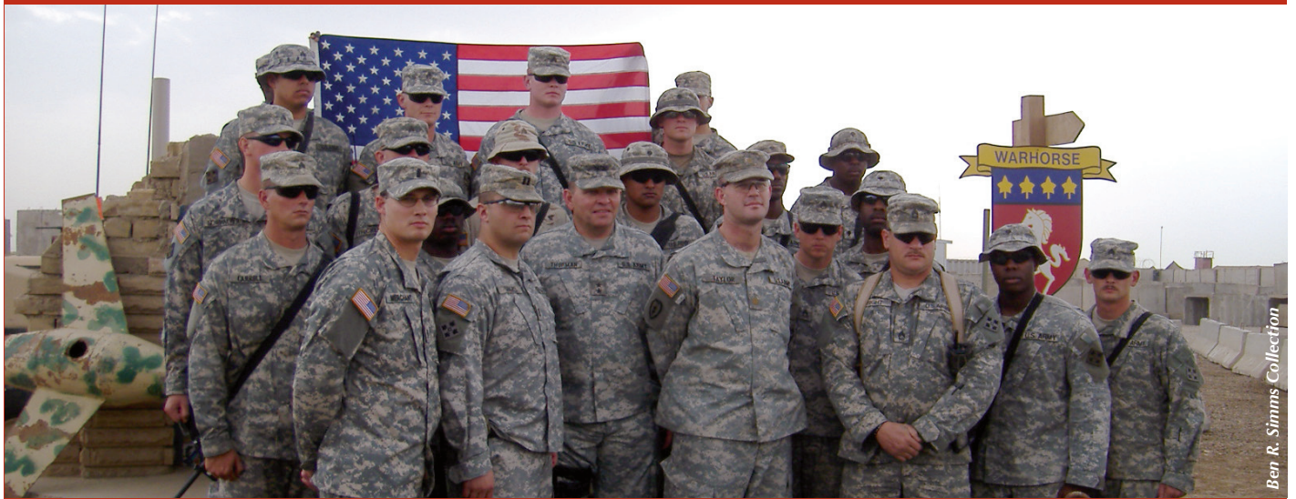
Ben R. Simms Collection