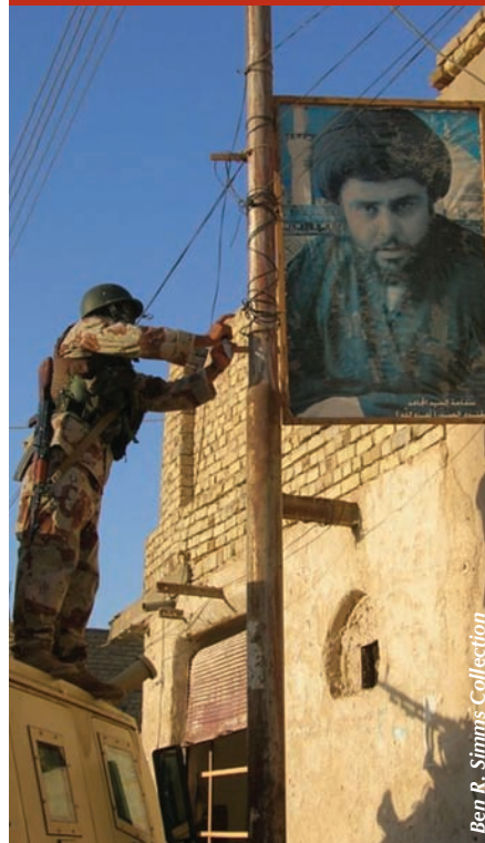
An Iraqi Army soldier removes a poster of Shia cleric Moqtada al-Sadr from a street in Diwaniyah.

Urgent security concerns in the normal sector of the 2d Battalion, 8th Infantry Regiment, had forced the Army to redeploy all of the battalion's infantry platoons back to Kalsu. Up to this point, Iraqi Army infantry had fought well beside U.S. forces, and the battalion's officers believed that a mix of U.S. tanks and Iraqi infantry would provide the combined arms versatility that is absolutely essential in urban warfare. To further complicate matters, for security reasons the Iraqi source and an interpreter both needed to stay with U.S. forces, so they rode in the loader's position in two of the tanks. This reduced the combat effectiveness of those two tanks.