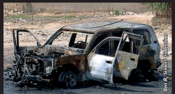
A sport utility vehicle belonging to a Coalition contractor destroyed by an improvised explosive device in Diwaniyah, c. September 2006

On the evening of 8 October 2006, the Dragoons received intelligence on the location of