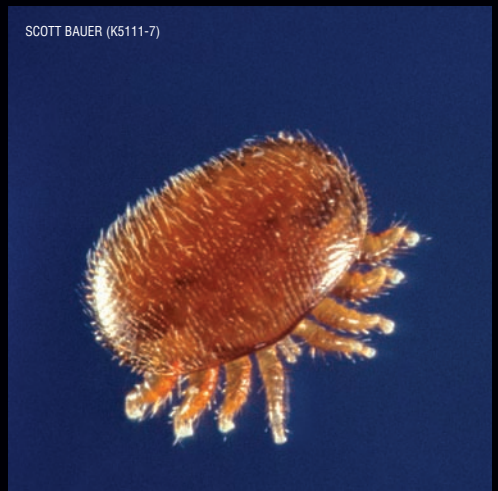
Close-up of a Varroa jacobsoni mite.

Varroa mites and other mites have created major new stresses on honey bees in the last couple of decades.