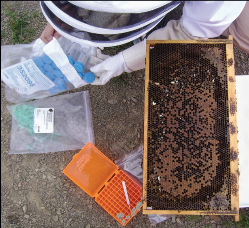
Yanping (Judy) Chen collects bee samples from colonies affected by colony collapse disorder. In the lab, she will analyze the samples for Israeli acute paralysis virus (IAPV) and other viruses.