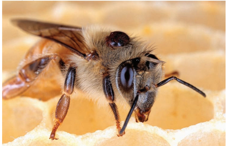
European honey bee with a Varroa mite on its back.