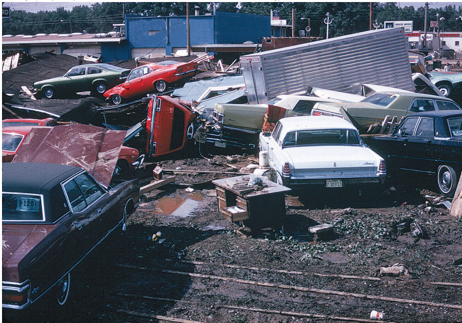
Figure 1. The 1972 flood destroyed 5,000 automobiles, including these cars that were parked at a dealership on East Boulevard.