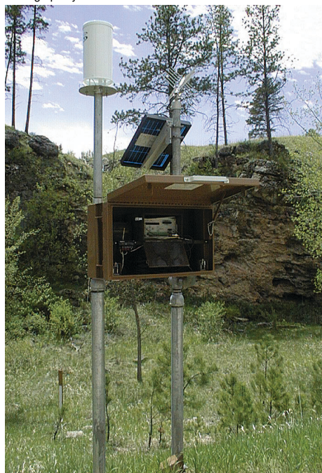
Figure 6. Photograph of a current flood-warning system gaging station. Real-time data from the gaging station are relayed via a satellite network to the National Weather Service and Rapid City-Pennington County Emergency Management.

Management can then coordinate emergency response, public safety services, and local governmental agencies as needed. Currently (2002), the USGS collects data at the 20 flood-warning sites in the Black Hills area, which are located along Battle, Spring, Rapid, Victoria, Boxelder, Spearfish, and Bear Butte Creeks and their tributaries.