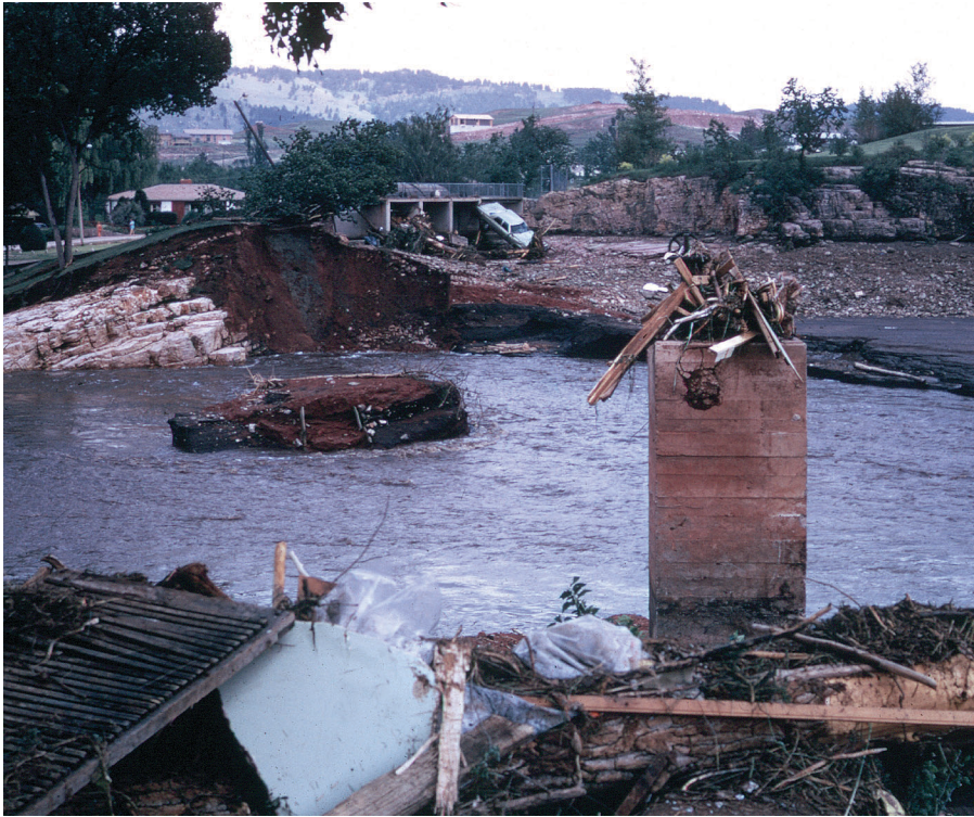
Figure 3. Photograph of the remains of the Canyon Lake Dam the morning after it failed. During the flood, the spillway of the dam clogged with floating debris. When the dam failed at about 10:45 p.m. on June 9, 1972, a surge of water was sent into urban Rapid City.

the peak flows moved into less-steep terrain, the flows spread out over a wide area, and much of the water was stored in the flood plains.