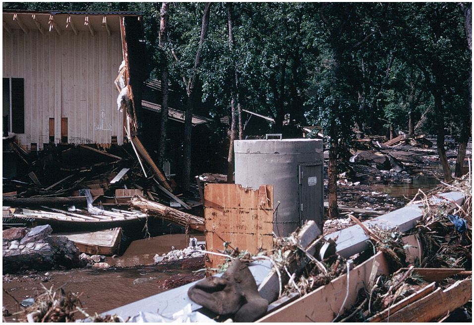
Figure 5. Photograph of U.S. Geological Survey streamflow-gaging station Rapid Creek above Canyon Lake near Rapid City (06412500) the day after the flood. A peak discharge of 31,200 cubic feet per second occurred at this site just before midnight on June 9, 1972. In the background are the remains of new houses that people were moving into the night of the flood.