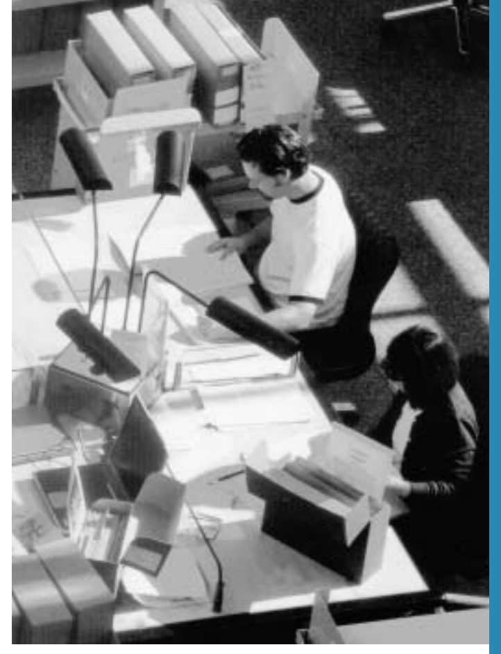
Two researchers in the textual research room at the National Archives at College Park, MD, study the records they have had pulled.