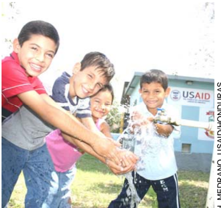
Having clean drinking water for the first time in their lives is a joyful occasion for these Honduran children.