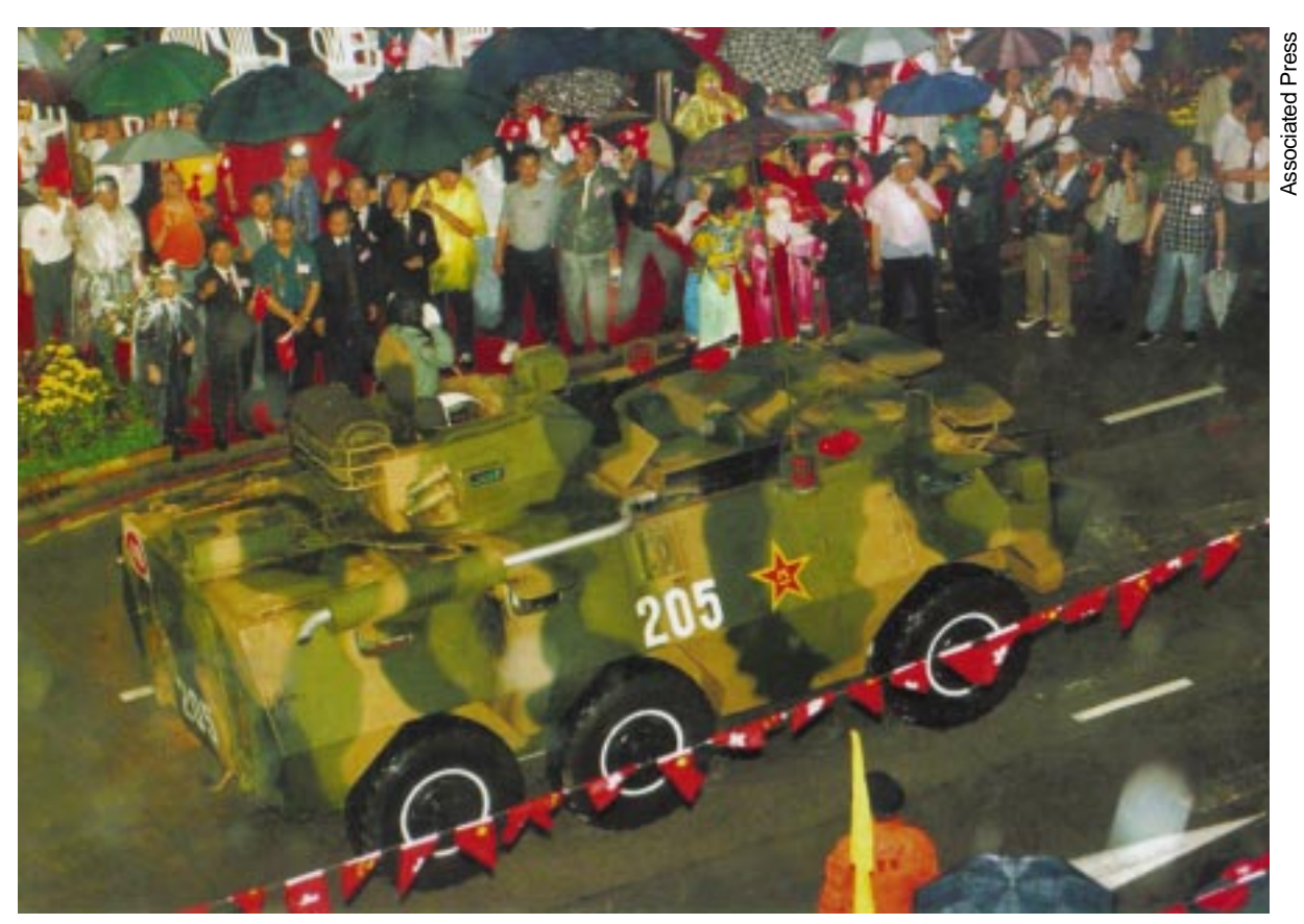
On July 1, 1997, legal control of Hong Kong reverted to the People's Republic of China, and troops from the People's Liberation Army entered Hong Kong. U.S. export policy, however, has continued to give Hong Kong the pre-1997 liberal controls on militarily sensitive technologies. As a result, export controls on the PRC were effectively liberalized on July 1, 1997, permitting the transfer of many additional technologies of potential use to the PLA without prior review by the Department of Commerce.

The 1992 Act called upon the U.S. Government to continue to treat Hong Kong as a separate territory in regard to economic and trade matters. It also provided for Hong Kong's continued access to sensitive U.S. technologies for so long as such technologies are protected.