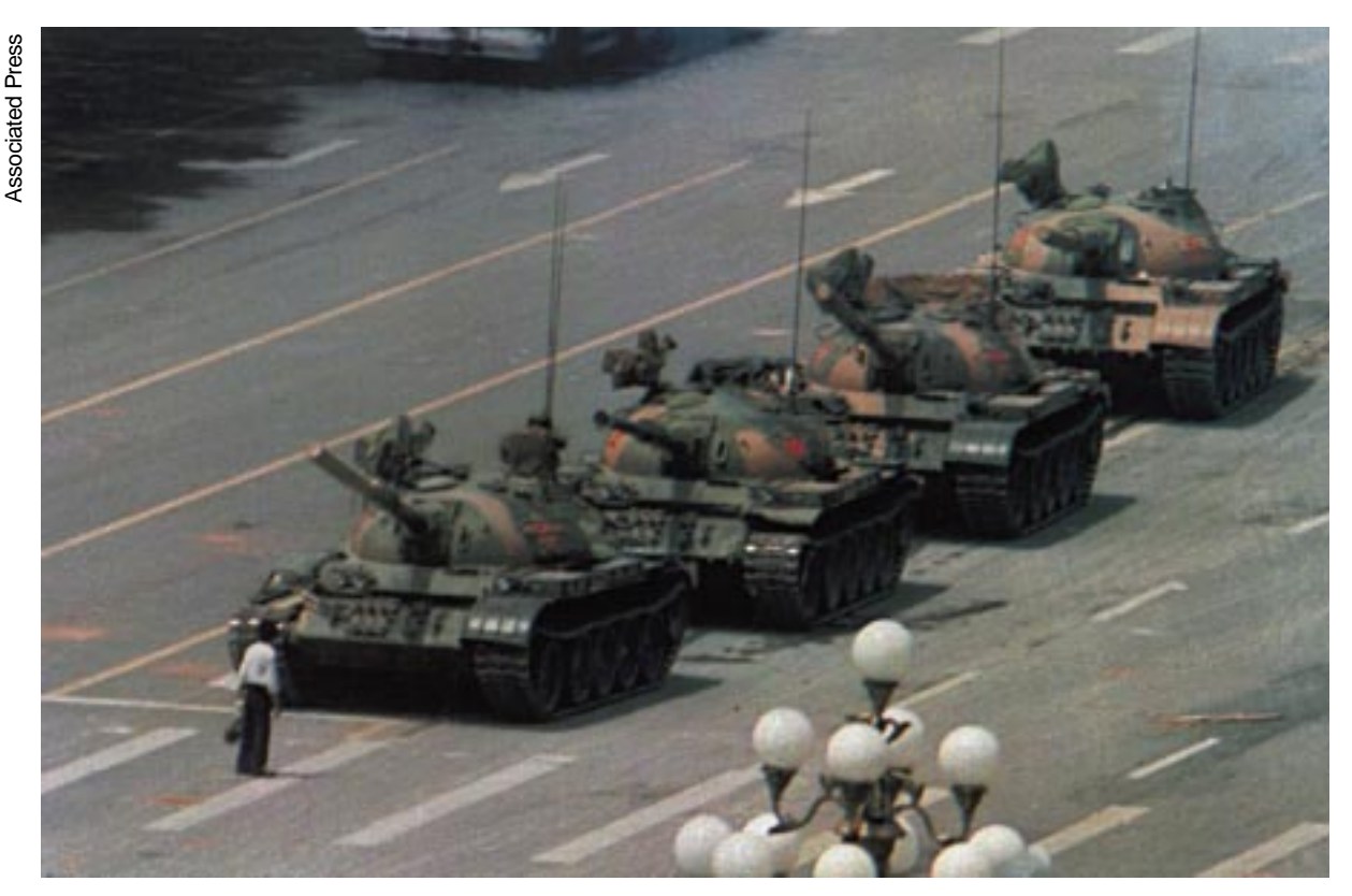
Prior to the June 4, 1989 massacre at Tiananmen Square in Beijing, the United States and other COCOM members differentiated between the People's Republic of China and the Soviet Union — and gave the PRC access to higher levels of technology.

When the 1988 Memorandum of Agreement on PRC commercial launch services expired on December 31, 1994, a third Memorandum of Agreement was signed in January 1995. This new agreement indicated that the PRC was not to launch more than 11 principal payloads to geosynchronous earth orbit or geosynchronous transfer orbit for international customers during the seven-year period ending on December 31,