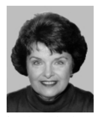
Sen. Dianne Feinstein of San Francisco Democrat—Nov. 10, 1992