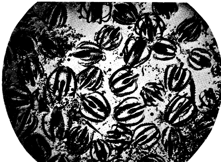
FIG. 18.—Plankton dominated by the ctenophore Pleurobrachia pileus , with barnacle ( Balanus ) larva in the "nauplius" stage. Browns Bank, April 16, 1920, haul from 40-0 meters (station 20106). \times 1.5