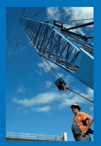
When requesting a