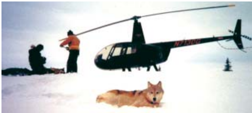
A radio-collared wolf recovers after being darted by biologists in Yukon-Charley Rivers National Reserve, Alaska.

Pictured Rocks National Lakeshore established an invasive nonnative aquatic species monitoring program. Monitoring sites for zebra mussels were established and maintained at motorized boat launches on inland lakes within the lakeshore. Control of sea lamprey was effectively conducted at Miner's River, in cooperation with the U.S. Fish and Wildlife Service. The lakeshore hired an aquatic ecologist.