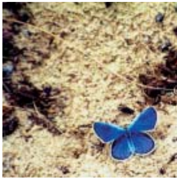
A federally endangered Karner Blue butterfly at Indiana Dunes National Lakeshore.

As of FY 2002, there are 1,129 populations of threatened, endangered, proposed, and candidate species known to be on NPS managed lands. At least 380 (34%) of these populations are making some progress towards recovery, exceeding the NPS goal of 15.2% by September 2002. A total of 86 populations (7.6%) are known to be improving. Another 294 (26%) populations are stable or not at risk, exceeding the mission goal of 21.3%. Natural Resource