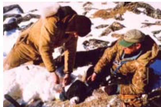
A Dall's sheep ewe is radio-collared in Yukon-Charley Rivers National Preserve, Alaska to investigate the impacts of military jet overflights on Dall's sheep.