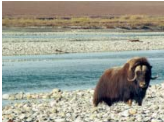
A few muskoxen have been observed recently in Gates of the Arctic National Park and Preserve, Alaska. It is possible these animals are beginning to recolonize areas of their native habitat. Subsistence species such as muskoxen are a vital part of the natural resources in arctic parklands.