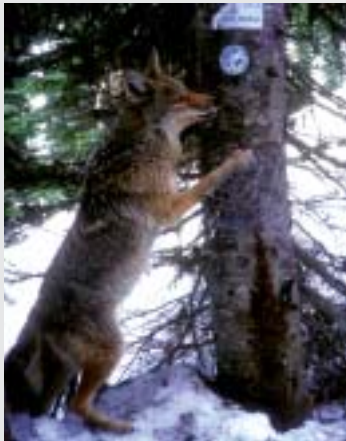
Coyote attracted to a bait station at Olympic National Park as part of the forest carnivore inventory and monitoring program. The hair snair pictured in this photo show how hair samples are being collected for DNA analysis.

NPSpecies now contains 22,013 records for the network parks, supported by 284 references, 3,730 voucher entries, and 24,698 observations. The network recorded 5 federal threatened and endangered species, 209 state threatened and endangered species, and 433 invasive nonnative species as present in the parks. The network also enlisted the assistance of volunteers for bird inventories at several parks.