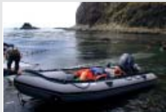
NPS staff arrange nets at Olympic National Park as part of tide pool fish monitoring.

herbarium from the 7 network parks. Contractors seined beaches at 6 sites in the intertidal zones and 21 tidal pools at Olympic National Park to assess intertidal fish populations. Native vascular plant inventories also received considerable attention at several parks. At Mount Rainier National Park, surveys were conducted in 31 locations to document the status of 14 state listed sensitive species. The park found rare plant populations at 8 locations, 7 of which were new sites. Several observations documented records more than 50 years old. At North Cascades National Park, field surveys of 10 rare plant species were conducted using the field sampling protocols developed at Mount Rainier National Park. These surveys documented rare plants in 5 previously known sites and 3 new locations. However, rare plant populations could not be found at 3 previously reported locations.