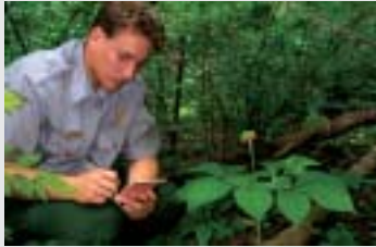
An NPS employee conducts ginseng monitoring in Catoctin National Park.

In FY 2002, the National Capital Network of 11 parks continued biological inventories for amphibians, reptiles, small mammals, and birds, and initiated inventories for fish and vascular plants in several parks. In addition, considerable effort was put into populating the Service-wide NPSpecies database with historical data from all parks in the network.