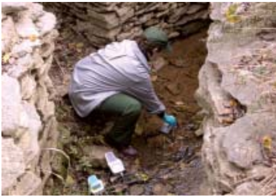
NPS employee conducts water quality monitoring at Stones River National Battlefield, Tennessee.

Presently, approximately 65% (184) of National Park System units have unimpaired water quality. (Thirty-five percent have within their