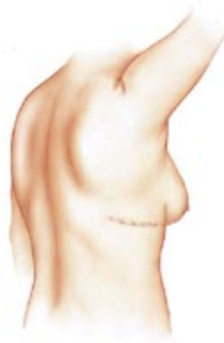
View Showing Back Scar