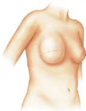
Stage 1: Tissue Expander Placed and Expansion Underway