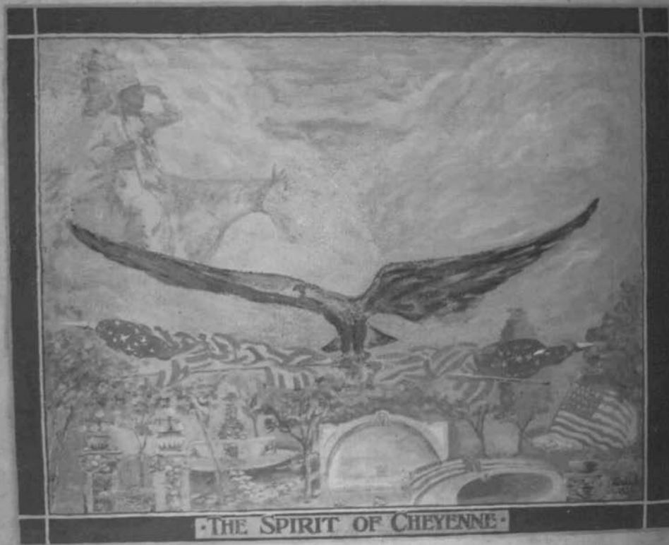
• THE SPIRIT OF CHEYENNE •