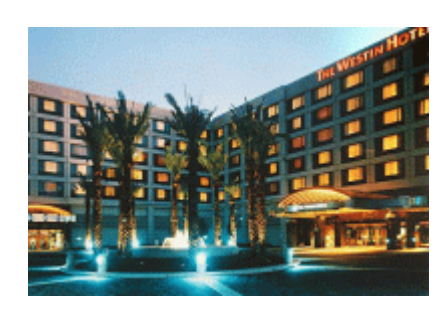
Westin San Francisco Airport Millbrae, CA