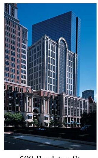
500 Boylston St. Boston, MA