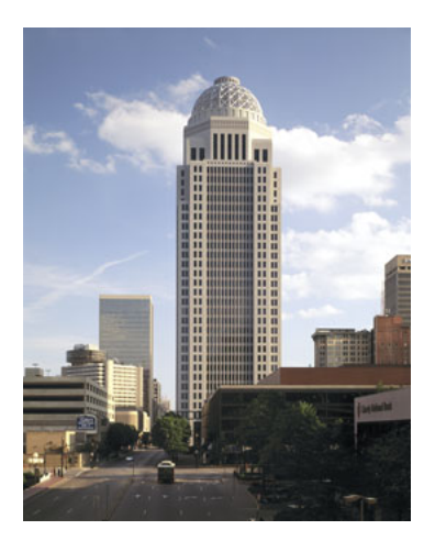
AEGON Center Louisville, KY