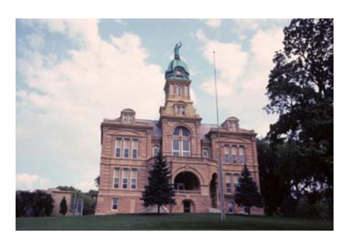
Blue Earth County Courthouse Mankato, MN