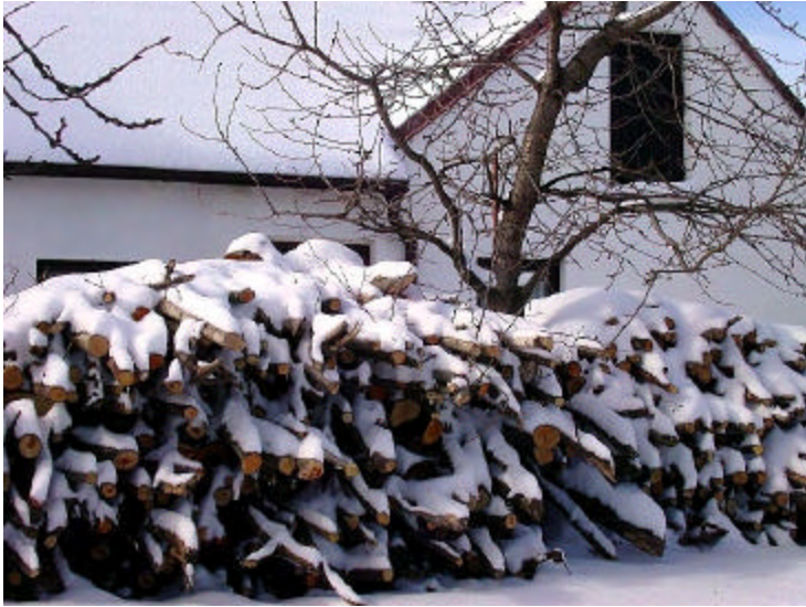
Fire wood may contain pest beetles