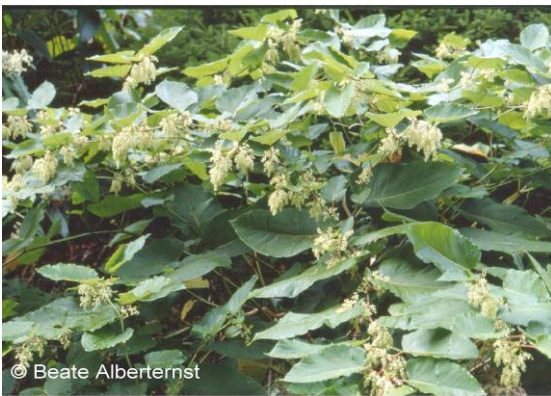
Fig. 3. F. sachalinensis , ♀