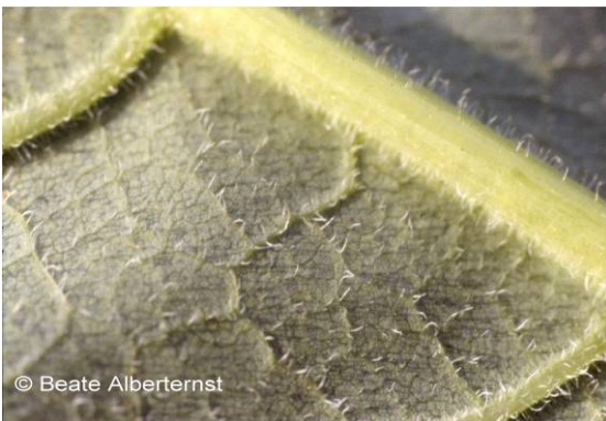
Fig. 5. Trichomes, F. sachalinensis