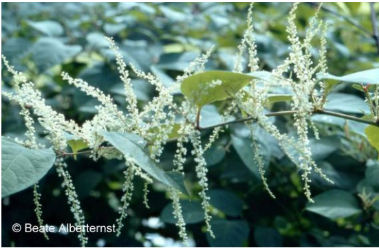
Fig. 1. F. japonica , ♀