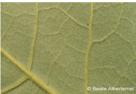
Fig. 7. Trichomes, F. x bohemica