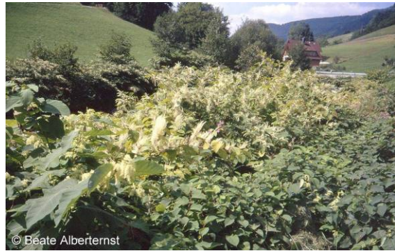
Fig. 2. F. japonica , F. sachalinensis and F. x bohemica , Wolfach, Black forest, Germany (1993)