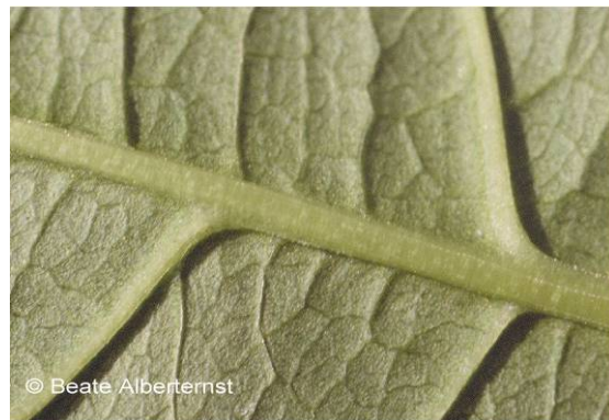
© Beate Alberternst Fig. 6. Trichomes, F. japonica