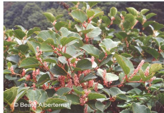
© Beate Alberternst Fig. 8. F. japonica var. compacta , Gernsbach, Germany