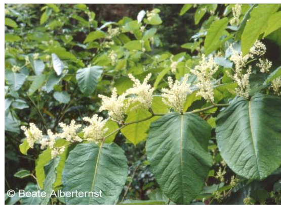
Fig. 4. F. sachalinensis , ♂