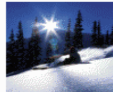
Eastern Sierra Ski Report

Make your reservations now. Don't forget the long February weekends and all the activities surrounding Spring Break.