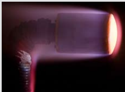
The 2007 NASA Government Invention of the Year is a heat shield material slightly more dense than balsa wood, designed to protect spacecraft during their fiery re-entry into Earth's atmosphere. The Lightweight Ceramic Ablator material (LCA) developed at Ames, weighs one-fifth as much as conventional heat shields, but can withstand temperatures up to 5,000 degrees Fahrenheit, according to project engineers at NASA.

The 2007 NASA Government Invention of the Year is a heat shield material slightly more dense than