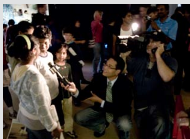
Local media interviewed visitors at the May 25, 2008 Phoenix Mars Lander touchdown event at Ames. Visitors heard presentations by several Ames scientists and cheered enthusiastically upon learning that the Phoenix had landed successfully.