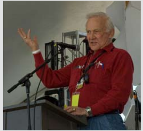
Astronaut Buzz Aldrin shown speaking at Yuri's Night Bay Area 2008.