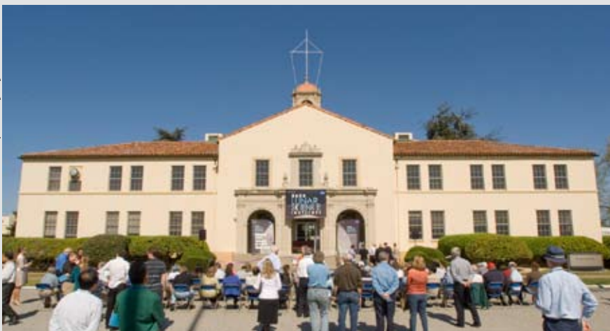
NASA's Lunar Science Institute opened at Moffett in Building 17 on April 11. The institute will feature teams of scientists across the U.S. who will be collaborating in lunar science and future lunar exploration.

tions from the moon will learn how to use the moon as a platform for performing scientific investigations. They will also consider how observations of the Earth and other celestial phenomena can be accomplished from the lunar surface.