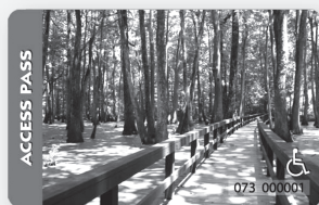
Interagency Access Pass FREE