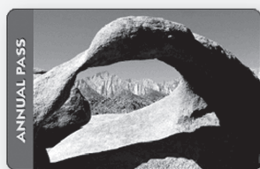
Interagency Annual Pass $80