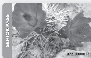
Interagency Senior Pass $10