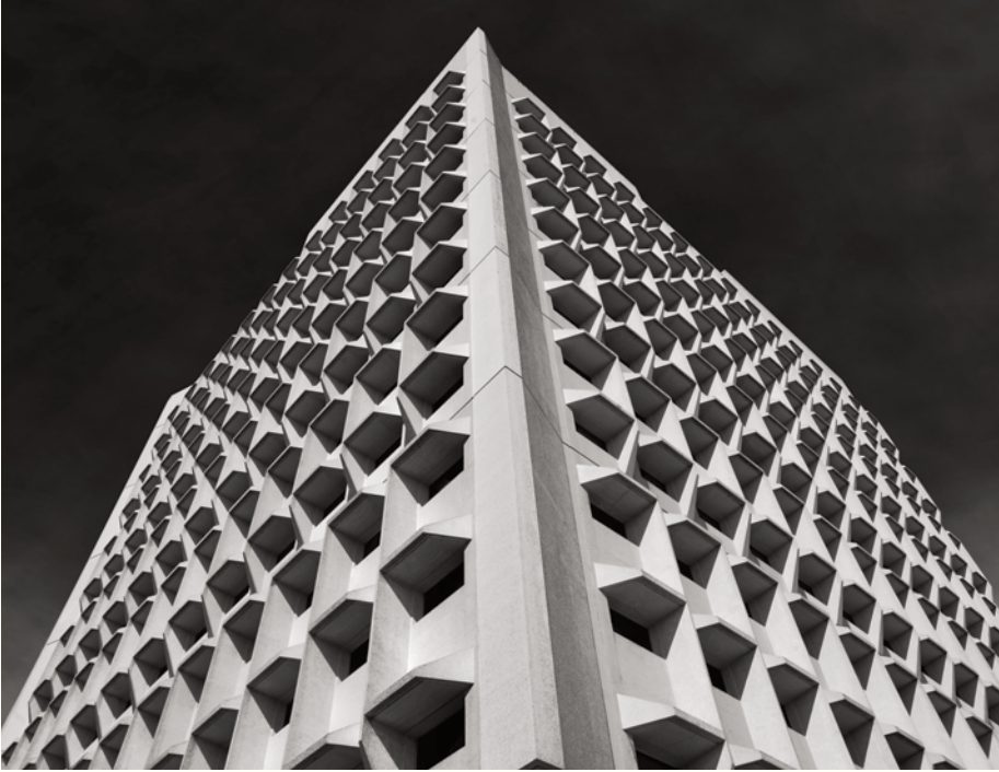
STROM THURMOND FEDERAL BUILDING AND U.S. COURTHOUSE COLUMBIA, SOUTH CAROLINA 1975-1979 MARCEL BREUER AND ASSOCIATES