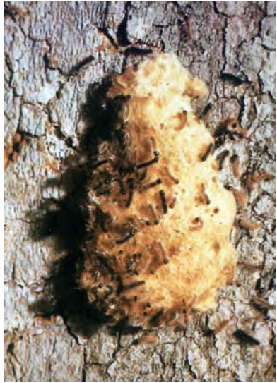
Figure 3 —Gypsy moth larvae emerging from egg mass.

host trees on silken threads (fig. 4) are carried by the wind for a distance of about 1 mile. Larvae can be carried for longer distances. Artificial dispersal occurs when people transport gypsy moth eggs thousands of miles from infested areas on cars and recreational vehicles, firewood, household goods, and other personal possessions.