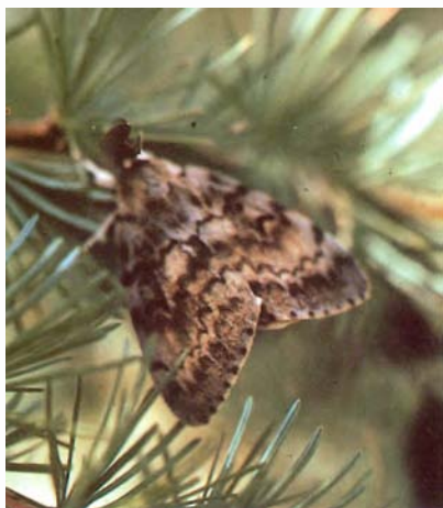
Figure 9— Male gypsy moth.