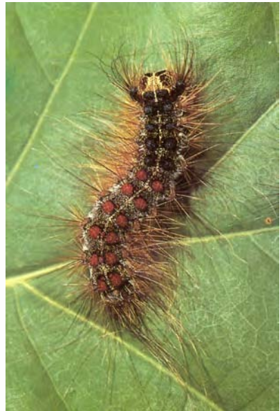
Figure 5 —Older gypsy moth larvae showing five pairs of raised blue spots and six pairs of raised brick-red spots.

tween mid-June and early July. They enter the pupal stage (fig. 8). This is the stage during which larvae