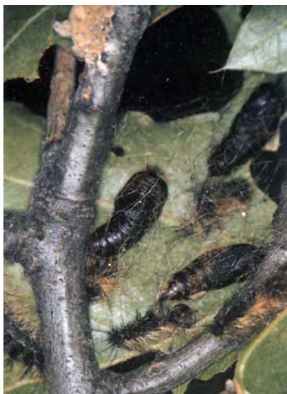
Figure 8— Gypsy moth pupa.