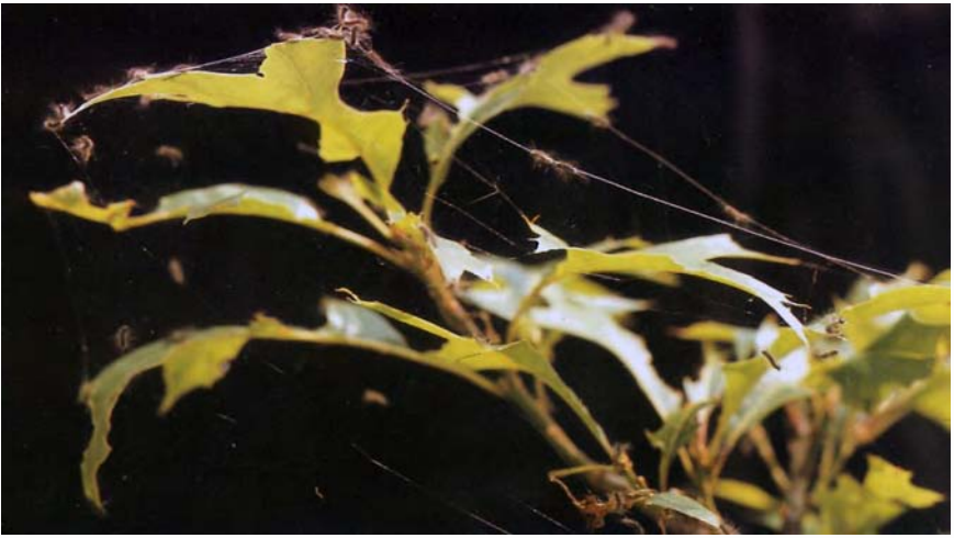
Figure 4 —Gypsy moth larvae suspended on silken threads.

leaves (fig. 6). The second and third instars feed from the outer edge of the leaf toward the center.