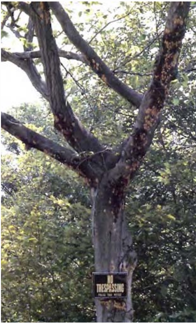
Figure 2 —Gypsy moth egg masses on the trunk and branch of a tree.

Larvae are dispersed in two ways. Natural dispersal occurs when newly hatched larvae hanging from