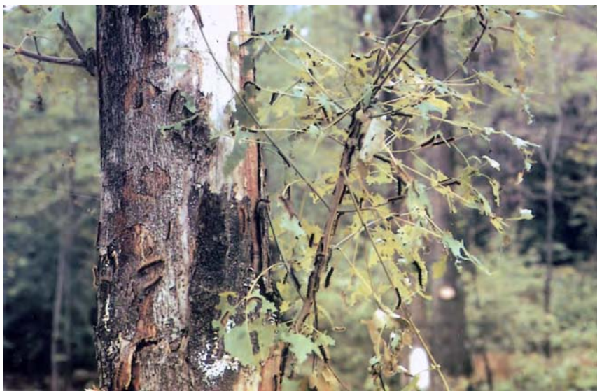
Figure 7 — A tree stripped by gypsy moth larvae.

Four to six weeks later, embryos develop into larvae. The larvae re- main in the eggs during the winter. The eggs hatch the following spring.