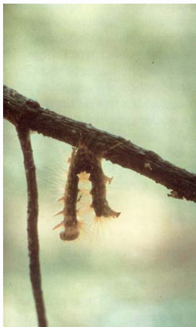
Figure 13—Larvae infected by the nucleopolyhedrosis virus (NPV) hanging in an inverted "V" position.

Wilt disease caused by the nucleopolyhedrosis virus (NPV) is specific to the gypsy moth and is the most devastating of the natural diseases. NPV causes a dramatic collapse of outbreak populations by killing both the larvae and pupae. Larvae infected with wilt disease are shiny and hang limply in an inverted "V" position (fig. 13).