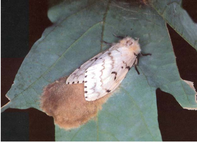
Figure 10 — Female gypsy moth laying eggs.