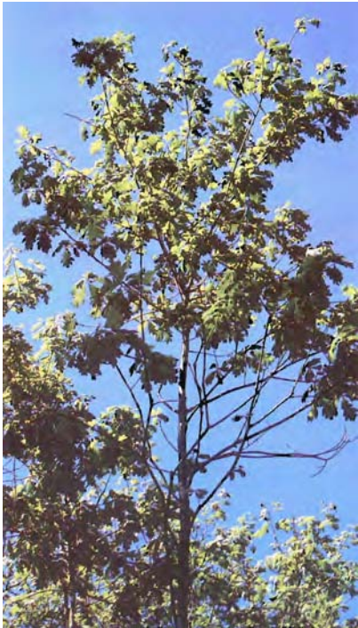
Figure 11 — Tree before defoliation.