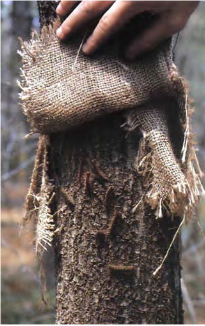
Figure 14 — Gypsy moth larvae and pupae under burlap.