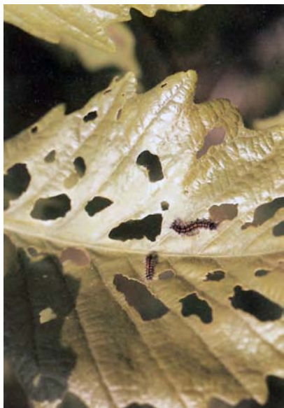
Figure 6 — First instar gypsy moth larvae chewing small holes in leaves.

change into adults or moths. Pupa- tion lasts from 7 to 14 days. When population numbers are sparse,