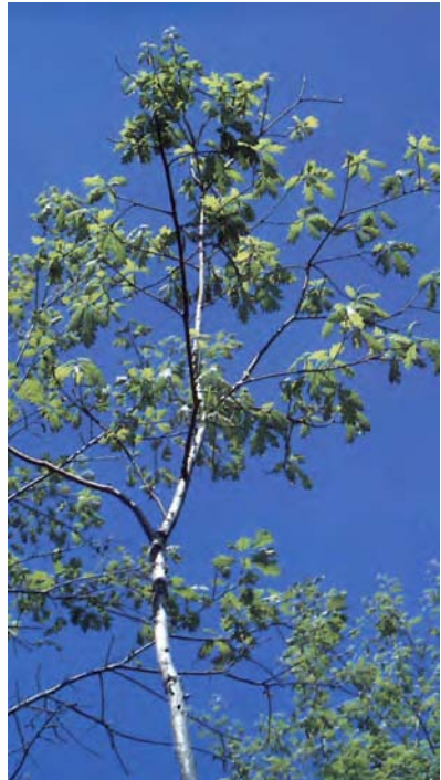
Figure 12 — Tree after refoliation.