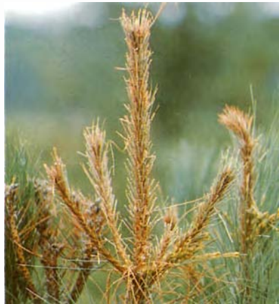
Figure 1.—A colony of nearly full-grown larvae feeding on needles of a host tree.