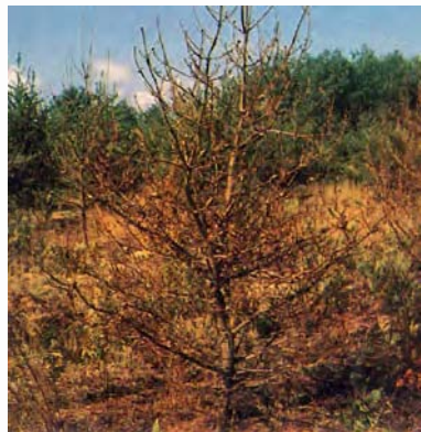
Figure 2.—Remains of needles consumed by young redheaded pine sawfly larvae.