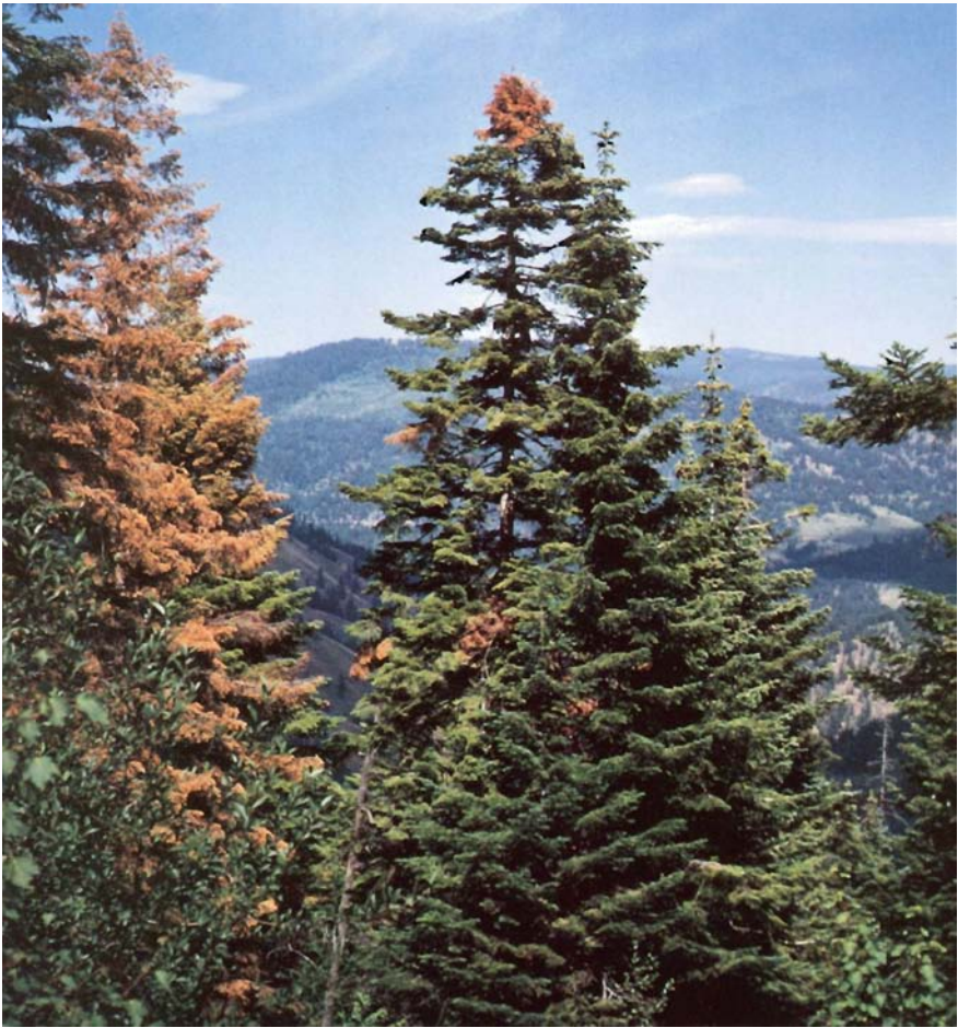
Figure 4 —A group of grand firs in Idaho displaying the variety of attack patterns that characterize the fir engraver. One tree has lost its top and some branches; its neighbor has been killed.

that are often formed when bark beetles attack pines are not produced on firs.