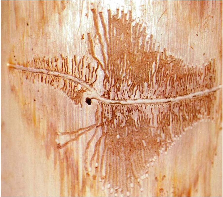
Figure 3 —An egg gallery with an adult fir engraver and larvae at the end of their parallel galleries.

When fir engraver populations are endemic, trees are still killed, but losses are less severe.