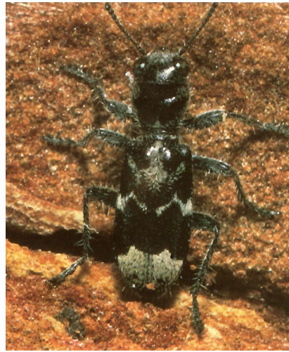
Figure 7 —Adult black-bellied clerid (two times natural size) which feeds on larval and adult fir engravers. This clerid is also a predator of the western pine beetle.

Silvicultural practices aimed at maintaining healthy stand conditions appear to offer the best chance for minimizing engraver-caused losses. Diseased, injured, or decadent trees should be removed, and overly dense stands should be thinned to reduce tree competition.