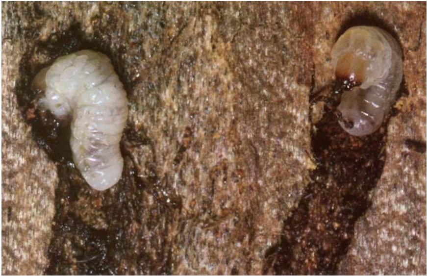
Figure 6 —Larvae at the end of their galleries beneath the bark of a California red fir.

Four to six days after the female begins boring the egg gallery, a yellowish-brown discoloration appears on the surrounding area. The stain is caused by the fungus Trichosporium symbioticum Wright, which is carried by the beetles.