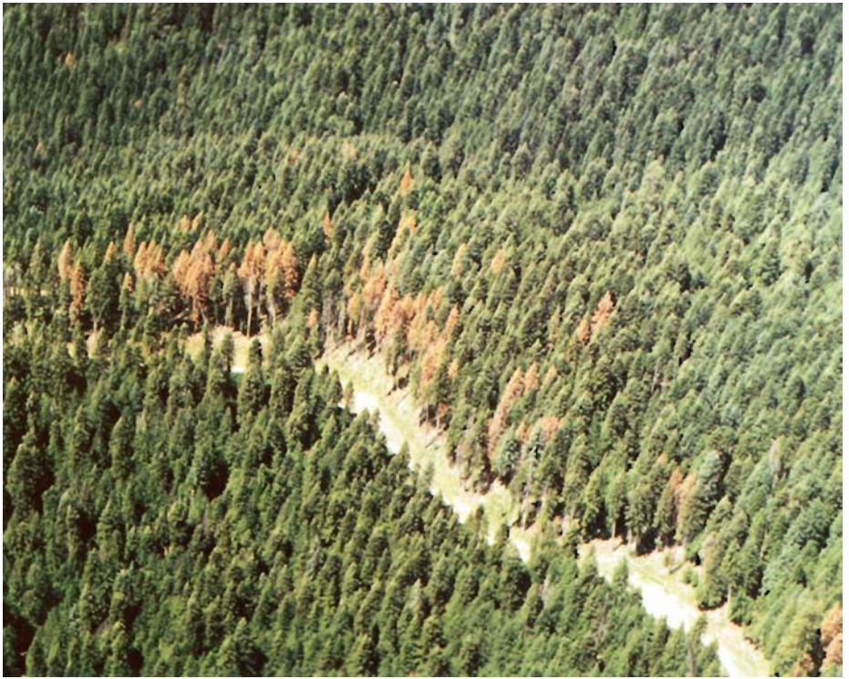
Figure 1 —Grand fir killed by the fir engraver during the 1974 outbreak on the Nezperce National Forest in Idaho.