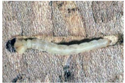
Figure 6. Larva of the bronze birch borer.

The pupa (figure 7) resembles the adult; it is initially creamy white and then darkens as it assumes adult pigmentation.