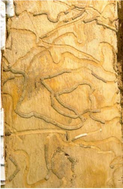
Figure 5. Meandering or zigzag galleries formed under the bark by tunneling larvae.