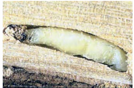
Figure 7. Pupa of the bronze birch borer.