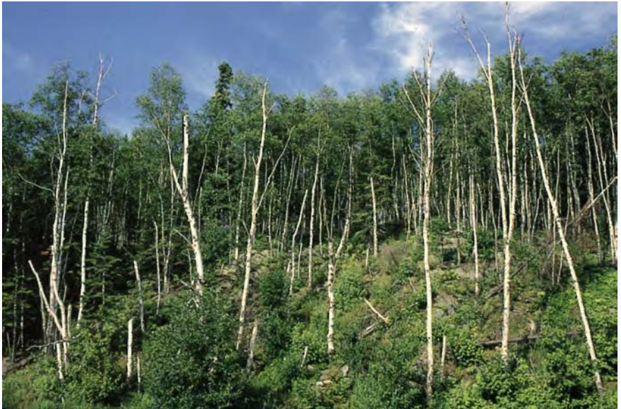
Figure 8. Paper birch killed after a severe regional drought in northern Minnesota.

Bronze birch borers infested and ultimately killed many of these trees (figure 8). Massive birch mortality was observed throughout the Great Lakes region in the early 1990’s indicating that many of the existing birch-dominated ecosystems throughout the region were aging and more likely to be stressed by weather events. Developing a mosaic of age classes should reduce bronze birch borer impact over a large area and contribute to the stability of the birch resource within that region.