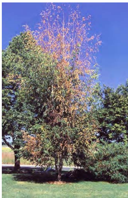
Figure 2. A landscape birch tree infested with bronze birch borers. Branches in the upper canopy are usually affected first.

The condition of host trees is the principal factor in the birch tree and borer relationship. Adult bronze birch borers primarily attack birches that are weakened or stressed by drought, old age, insect defoliation, soil compaction, or a stem or root injury. Birch trees prefer cool, moist growing locations and have a shallow root system that is easily injured by disturbance or dry, hot conditions. Many landscape birch trees are planted in unsuitable habitats and are stressed on a regular basis. Birch trees growing within a forest are stressed by old age, weather events such as drought, or by repeated defoliation. Widespread birch mortality often occurs after these events.