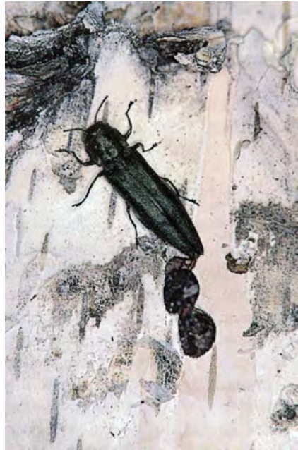
Figure 1. Bronze birch borer adult and two D-shaped exit holes.

Bronze birch borers are known to attack all native and introduced birch species, although birch susceptibility varies. Many varieties of birch species as well as numerous crosses between species are currently planted as ornamentals in North America. Although some varieties are more resistant than others, none are im-