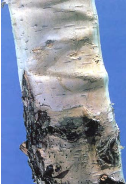
Figure 3. Swellings or bumps formed where a tree has healed over a gallery of the bronze birch borer.