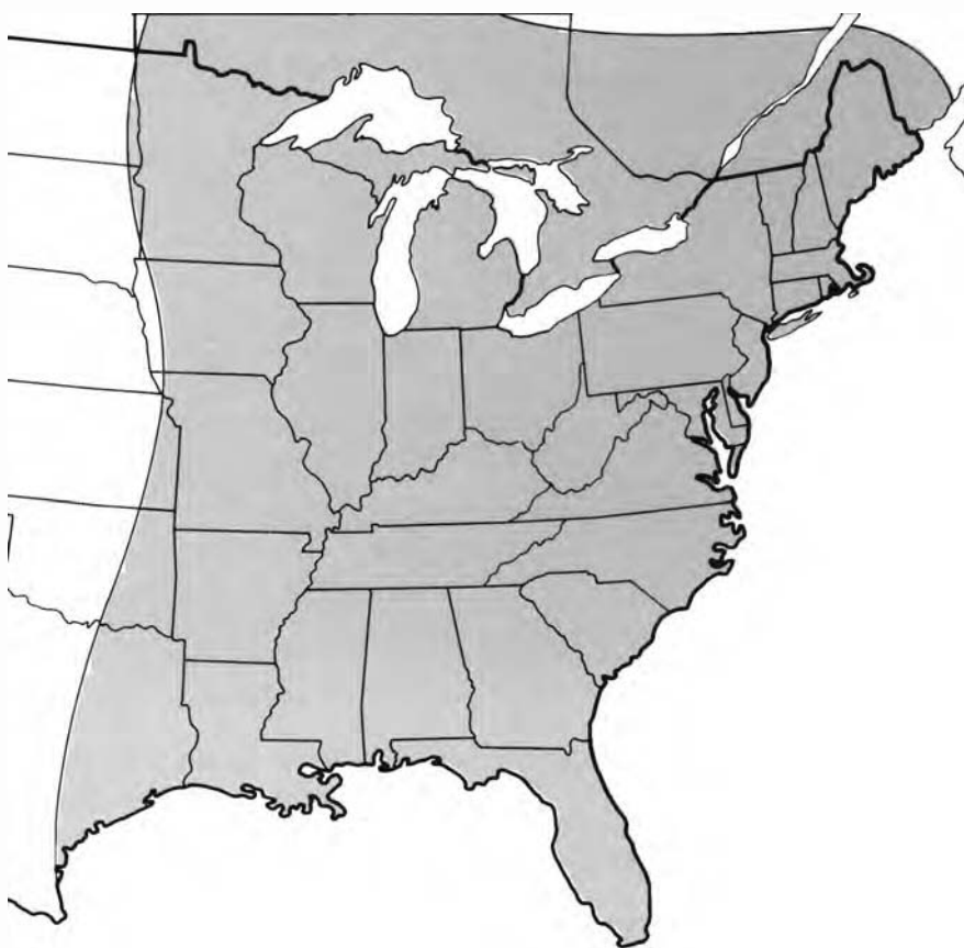
Figure 1.—Range of pales weevil.

In eastern North America, pales weevil has been recorded feeding on most native and several exotic con-