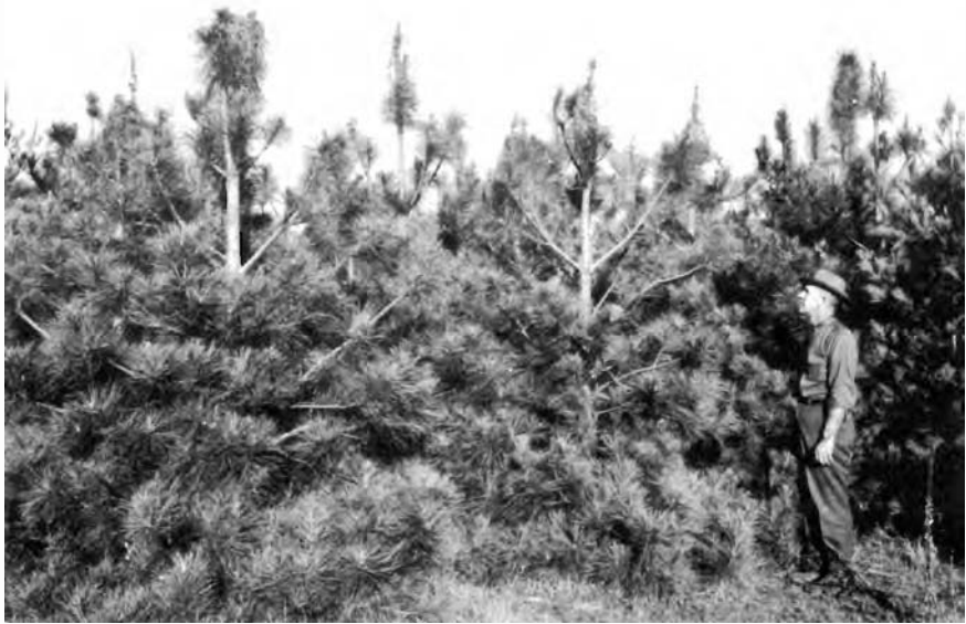
Figure 3.—Badly damaged red pine stand showing spiked and bushy tops.

When the terminal and lateral buds on a leader are killed by the shoot moth, a dead spike top (fig. 3) may result. Fascicle buds often develop from the shoot below this point, forming a dense growth or bush (fig. 3) the following season. Sometimes when the terminal bud is killed, several lateral buds develop into competing leaders, resulting in a forked stem (fig. 4). When a new shoot is weakened to the point where it falls over yet continues to grow, a severe crook (fig. 5) develops. Larval feeding on only one side