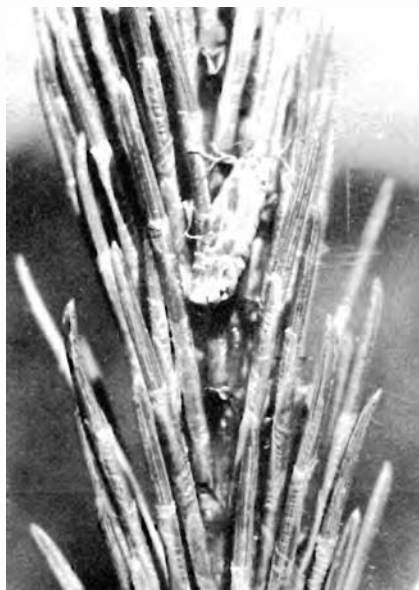
F-493468 Figure 6.—European pine shoot moth adult resting on a shoot.

Usually within 24 hours after they emerge, the adults mate and the females begin laying eggs. The egg-laying period lasts for several weeks. During the day adults remain at rest on the trees, flying only when disturbed. They fly spontaneously and vigorously at dusk.