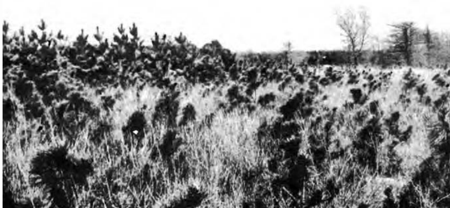
Figure 7. — Bottom whorls of branches being removed in a young red pine planting for shoot moth control.