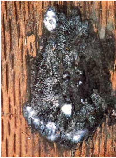
Figure 4.— Fungus mat. F-703169