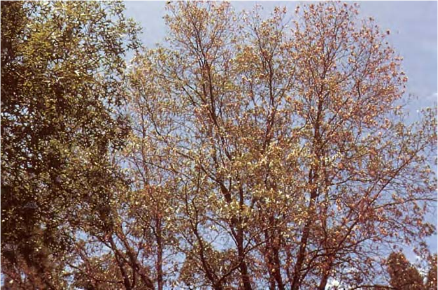
Figure 3. — Oak wilt symptoms.