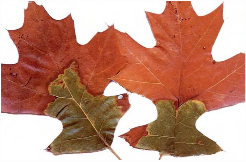
Figure 2. — Oak wilt symptoms on red oak leaves.