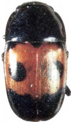
Figure 7. —Sap-feeding beetle. F-703172

trees to wounds on healthy oaks, the disease-causing spores are transmitted to a new host.