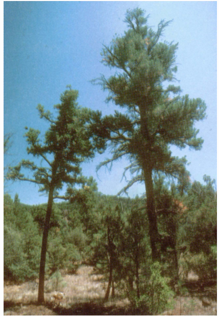
Figure 3. Witches' brooms on severely infected pinyon pines.

There are natural factors that affect the distribution of pinyon pine dwarf mistletoe, especially wildfires, which have been nature's primary control agent. Also, several species of insects and fungi may attack and kill pinyon pine dwarf mistletoe shoots or fruits.