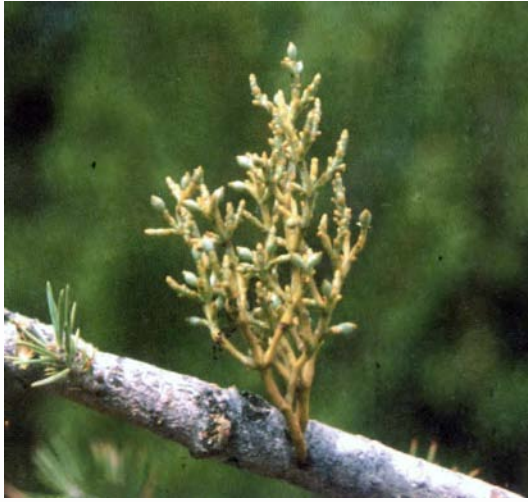
Figure 2. Female plants of pinyon pine dwarf mistletoe.

base of needles. Fastened in place on small branches when the viscin dries, seeds over-winter in a dormant state. Seeds are often destroyed by insects and fungi, or dislodged by rain and snow, so only a small proportion of those dispersed actually survive and cause new infections.