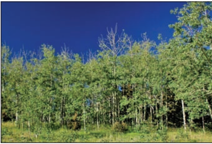
Figure 7 – Top kill in quaking aspen following several successive years of defoliation by western tent caterpillar.

Western tent caterpillar is known to have a number of natural enemies that help keep populations under control. These include parasites, predators and disease organisms. Some 36 species of parasites and predators have been documented as attacking this insect. Some of the more important parasitoids are wasps. Tetrastichus malacosome Girault (Hymenoptera: Eulophidae) attacks the eggs and Habrobracon (= Bracon ) xanthonotus (Ashmead) (Hymenoptera: Braconidae) is a common parasite of the larvae. The larval stage of this parasitoid feeds externally on the larvae of western tent caterpillar.