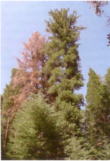
Figure 4. Witches' brooms associated with severe infection by sugar pine dwarf mistletoe on sugar pine. The dead tree on the left was also infected with sugar pine dwarf mistletoe and was killed by mountain pine beetles.

in these brooms have several mistletoe plants on them. In severely infected pines, witches' brooms often encompass most of the tree's foliage and represent a significant drain on the tree's vigor.