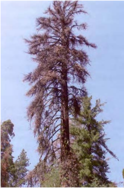
Figure 5. Dead, mature sugar pines severely infected with sugar pine dwarf mistletoe and killed by mountain pine beetle in the Sierra Nevada Mountains. Note the numerous, large witches' brooms scattered throughout the crown of this dead tree.

and each third rated as: 0 = no visible infection, 1 = light infection (less than half of the branches in the crown third have dwarf mistletoe infections), or 2 = severe infection (more than half of the branches in the crown third have infections). The three ratings are then added to obtain a tree rating. The tree ratings of all live trees (including uninfected ones) are then averaged to obtain a stand or plot rating. The 6-class DMR system has been used since the late 1950s and is the standard protocol in the U.S., Canada, and Mexico for assessing severity of dwarf mistletoe infection on individual trees and within stands.