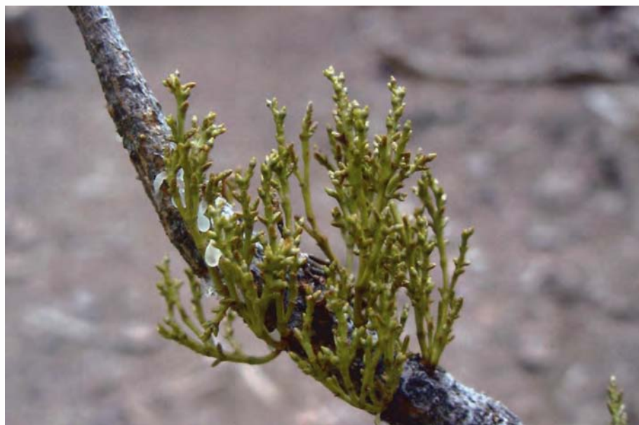
Figure 2. Female plants of sugar pine dwarf mistletoe.

Dwarf mistletoes are small, seed-bearing parasitic plants. The external (aerial) shoots of sugar pine dwarf mistletoe are yellow to yellow-green and have their leaves reduced in size to small scales. The shoots are perennial and usually about 3-4 inches (7-10 cm) long (Figure 2). The shoots of western white pine dwarf mistletoe