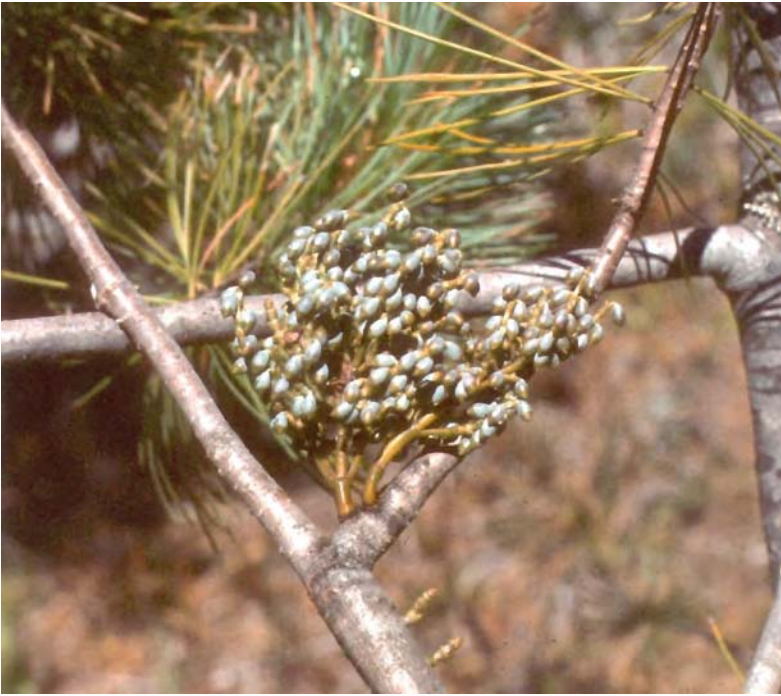
Figure 3. Female plants of western white pine dwarf mistletoe. The fruits on this plant are nearly mature.

are typically dark brown and about 2-4 inches (5-10 cm) long (Figure 3). Aerial shoots arise from a network of root-like strands embedded in host branches. This network, called the endophytic system, consists of two parts: 1) cortical strands growing longitudinally in the bark, and 2) sinkers growing radially in the wood. The endophytic system absorbs nutrients and water from infected branches, and will usually continue to live as long as infected host tissue remains alive. Dwarf mistletoes are dependent upon their host tree for water, minerals, and carbohydrates. Although the aerial shoots do contain some chlorophyll which allows them to produce small quantities of carbohydrates through photosynthesis, the principal function of aerial